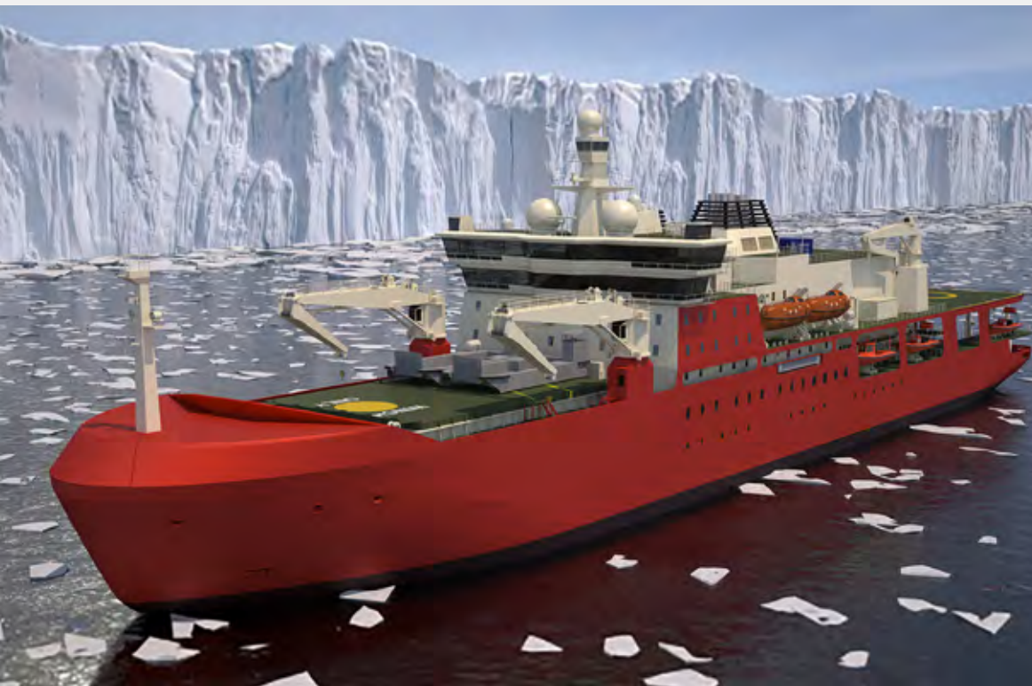
Nuyina, YN 417000 (2021)

CUSTOMER: Damen Schelde, Galați TYPE: ASRV Icebreaker, Research vessel (160 m) TYPE OF WORK: Newbuild SCOPE OF SUPPLY: Electrical Engineering and Integration, Equipment delivery, Supply and Installation of loose equipment and cables.