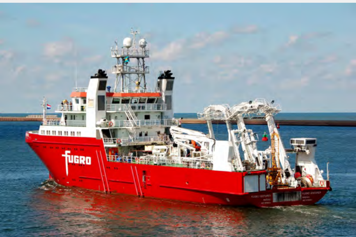
Fugro Venturer (2017)

CUSTOMER: Fassmer TYPE: Research & Survey vessel (72 m) TYPE OF WORK: Newbuild SCOPE OF SUPPLY: System integration, vessel automation, power distribution system; navigation and communication system, consoles.