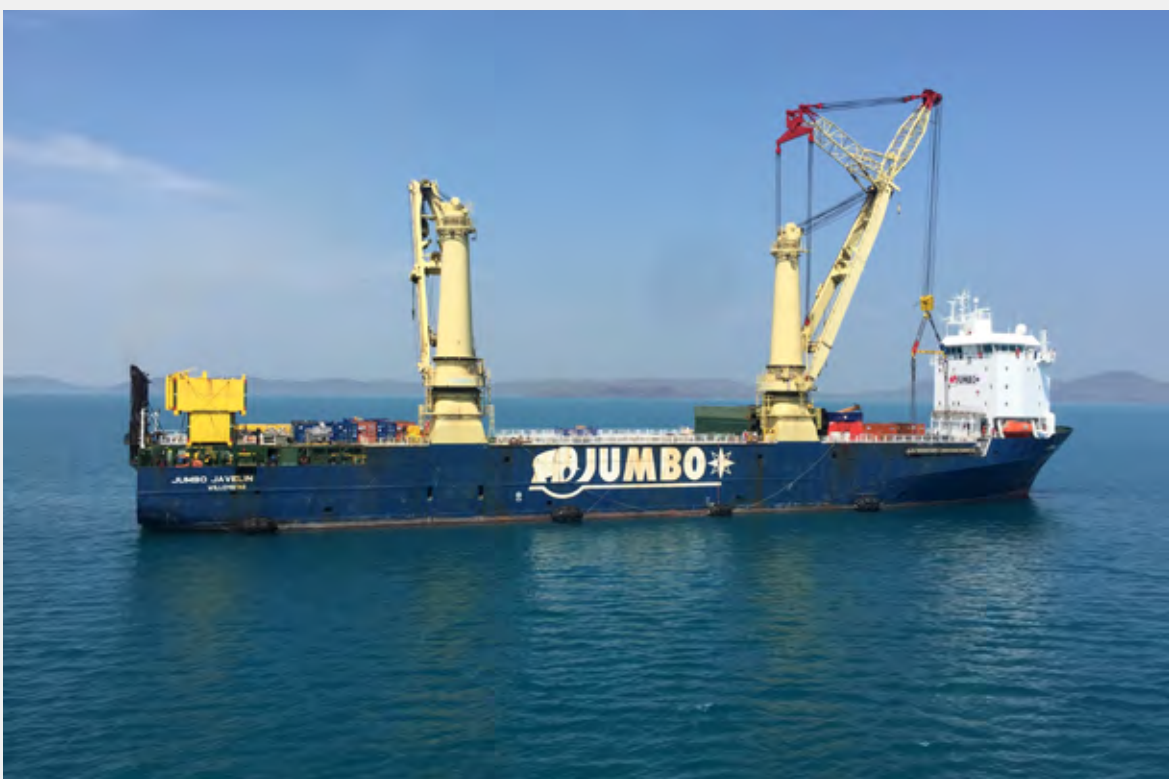
Jumbo Javelin (2020)

CUSTOMER: Allseas TYPE: Offshore Construction Vessel (150 m) TYPE OF WORK: Service SCOPE OF SUPPLY: Automation window heating system.