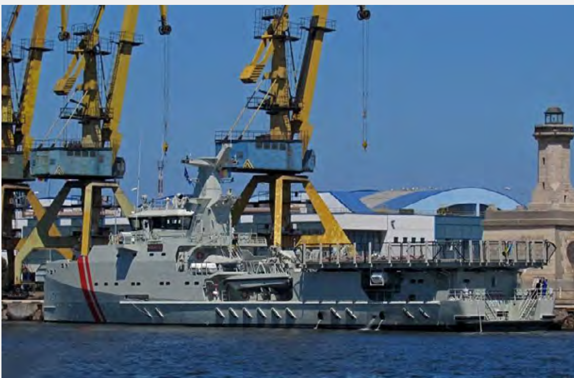
OPV 6711 UAE / Arialah (2016)

CUSTOMER: Damen Schelde Naval Shipbuilding TYPE: Guided-missile Frigate (105.1 m) TYPE OF WORK: Newbuild SCOPE OF SUPPLY: Engineering and integration of platform system, materials and equipment/system delivery, installing of cable and set to work activities.