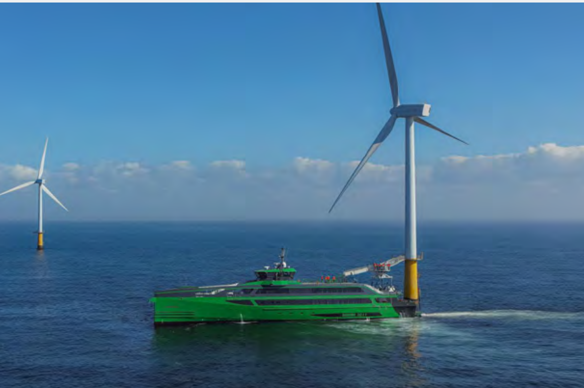
Aqua Helix (2022)

CUSTOMER: McDermott TYPE: Pipe layer (142 m) TYPE OF WORK: Refit SCOPE OF SUPPLY: Conversion to pipe-lay vessel.