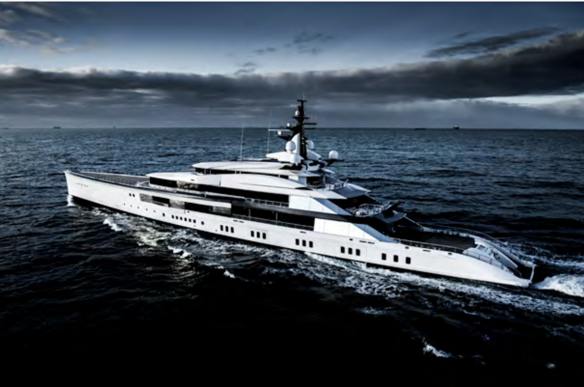
Bravo Eugenia (2018)

CUSTOMER: Oceanco TYPE: Motor Yacht (109 m) TYPE OF WORK: Newbuild SCOPE OF SUPPLY: System integration and complete electrical installation, IT systems, hybrid system, AMCS.