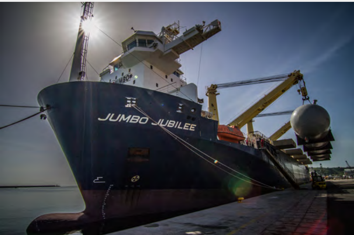
Jumbo Jubilee (2019)

CUSTOMER: Jumbo Maritime TYPE: Heavy Load Carrier (145 m) TYPE OF WORK: Service SCOPE OF SUPPLY: Power distribution system.