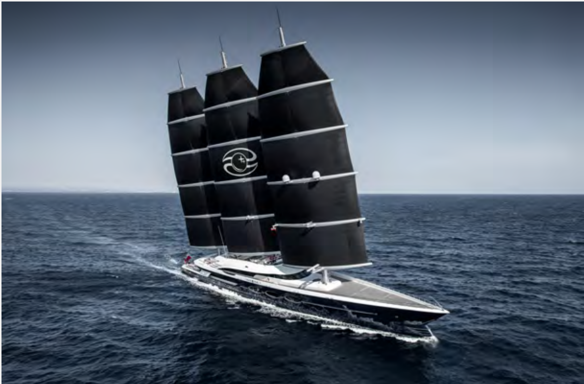
Black Pearl (2018)

CUSTOMER: Oceanco TYPE: Motor Yacht (109 m) TYPE OF WORK: Newbuild SCOPE OF SUPPLY: System integration and complete electrical installation, IT systems, hybrid system, AMCS.