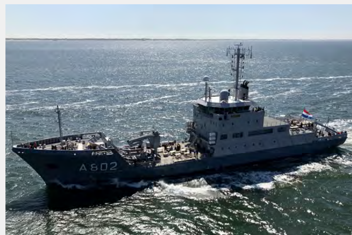
Zr. Ms. Snellius (2020)

CUSTOMER: Damen Shipyard Den Helder TYPE: Naval Auxiliary Vessel (65 m) TYPE OF WORK: Refit SCOPE OF SUPPLY: Mid-Life upgrade and maintenance.