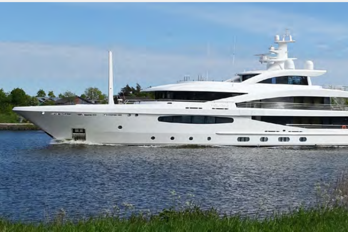
Volpini 2 (2018)

CUSTOMER: Oceanco TYPE: Motor Yacht (90m) TYPE OF WORK: Newbuild SCOPE OF SUPPLY: Systems integration and complete electrical installation, AMCS.