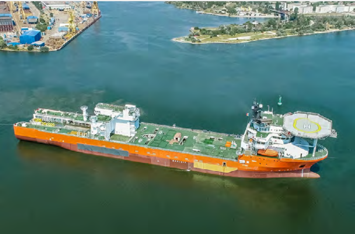
Benguela Gem, YN 594001 (2021)

CUSTOMER: IHC and McDermol TYPE: Pipe Laying Vessel (199m) TYPE OF WORK: Refit SCOPE OF SUPPLY: Installation of all electric cabling for complete refit.