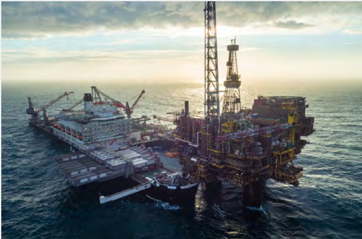
Pioneering Spirit (2020)

CUSTOMER: Damen Shipyard Mangalia TYPE: Offshore diamond recovery vessel (176.5 m) TYPE OF WORK: Newbuild SCOPE OF SUPPLY: Supply and installation of loose equipment and cables.