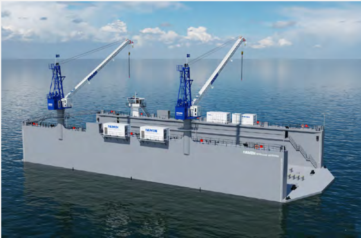
Modular Dry Dock 8026-4 (2017)

CUSTOMER: DEME TYPE: Cable Layer (161 m) TYPE OF WORK: Refit SCOPE OF SUPPLY: Infrastructure (cable routing, cable trays).