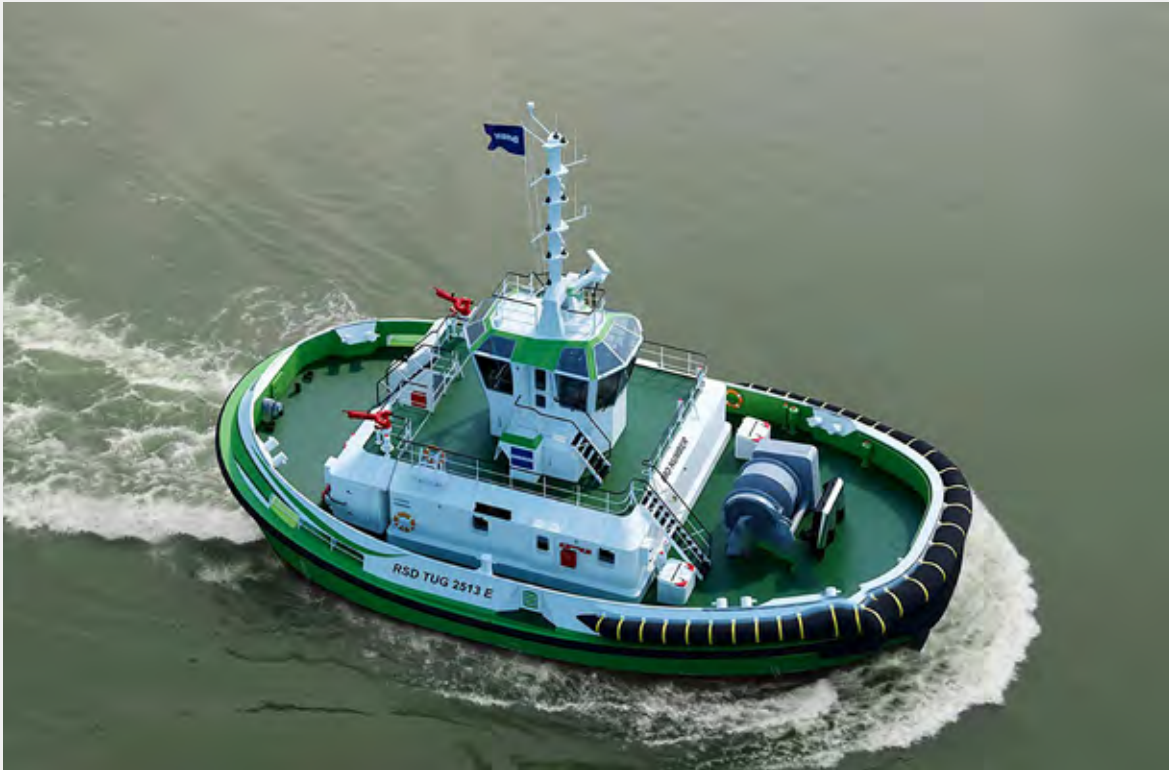
RSD2513 YN515011-16 (2020)

CUSTOMER: Damen Shipyards Gorinchem TYPE: Tug boat (23 m) TYPE OF WORK: Newbuild SCOPE OF SUPPLY: Switchboards and consoles.