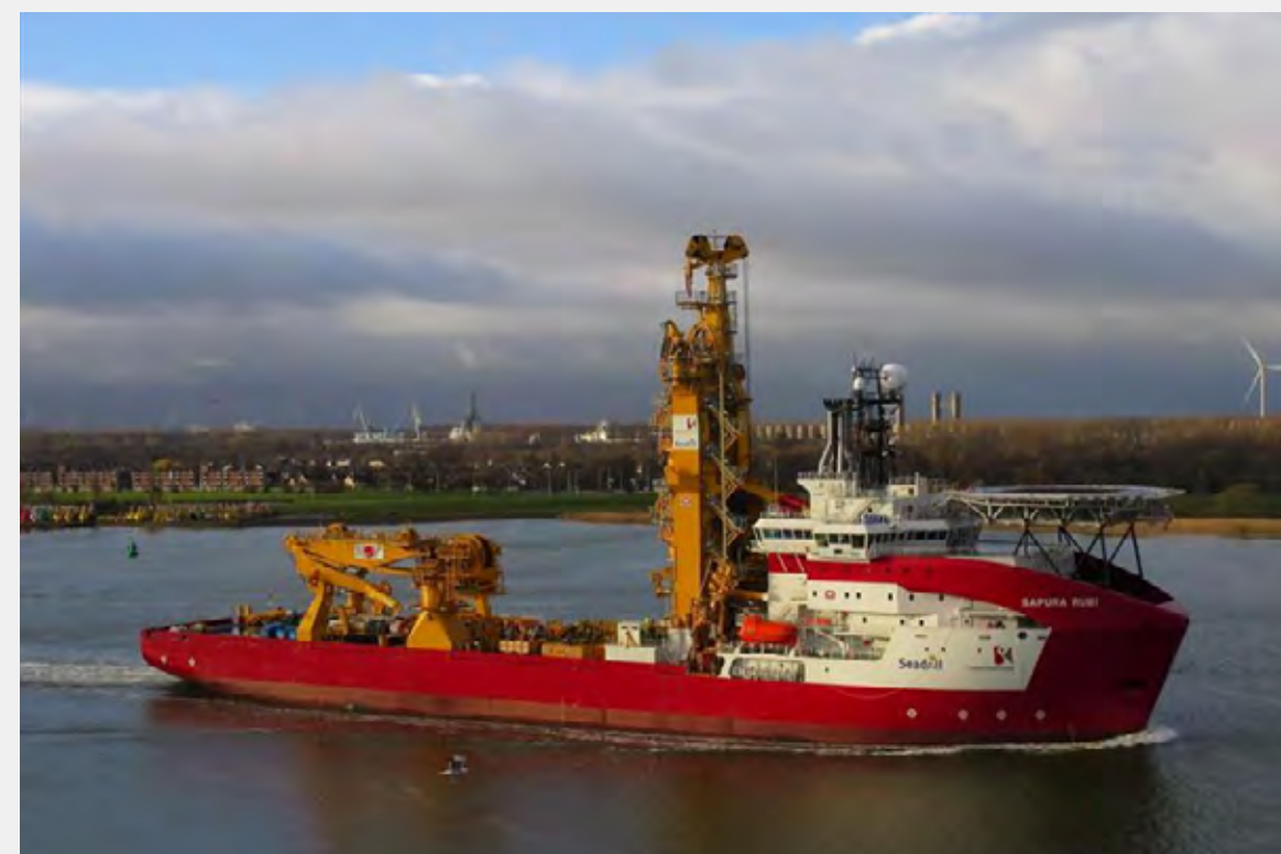
Sapura Rubi (2016)

CUSTOMER: IHC Offshore & Marine TYPE: Pipe Laying Support Vessel (145.9 m) TYPE OF WORK: Newbuild SCOPE OF SUPPLY: System Integration, complete electrical installation.