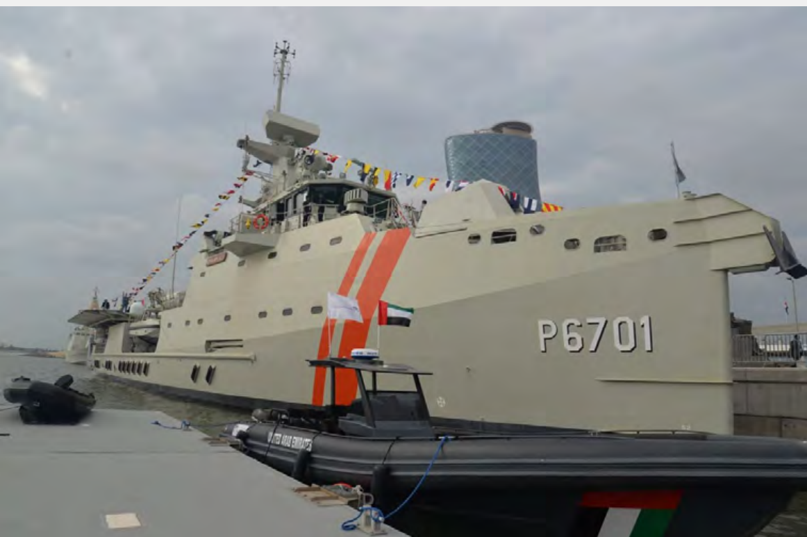
OPV 6711 UAE / Hmeem (2016)

CUSTOMER: Damen Shipyards Gorinchem TYPE: Offshore Patrol Vessel (67 m) TYPE OF WORK: Newbuild SCOPE OF SUPPLY: Electrical package delivery. Engineering, installing and commissioning.