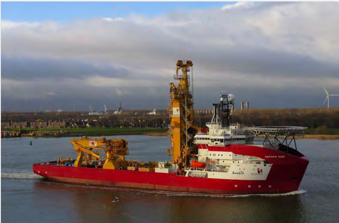
Sapura Rubi (2016)

CUSTOMER: IHC Offshore & Marine TYPE: Pipe Laying Support Vessel (145.9 m) TYPE OF WORK: Newbuild SCOPE OF SUPPLY: System Integration, complete electrical installation.