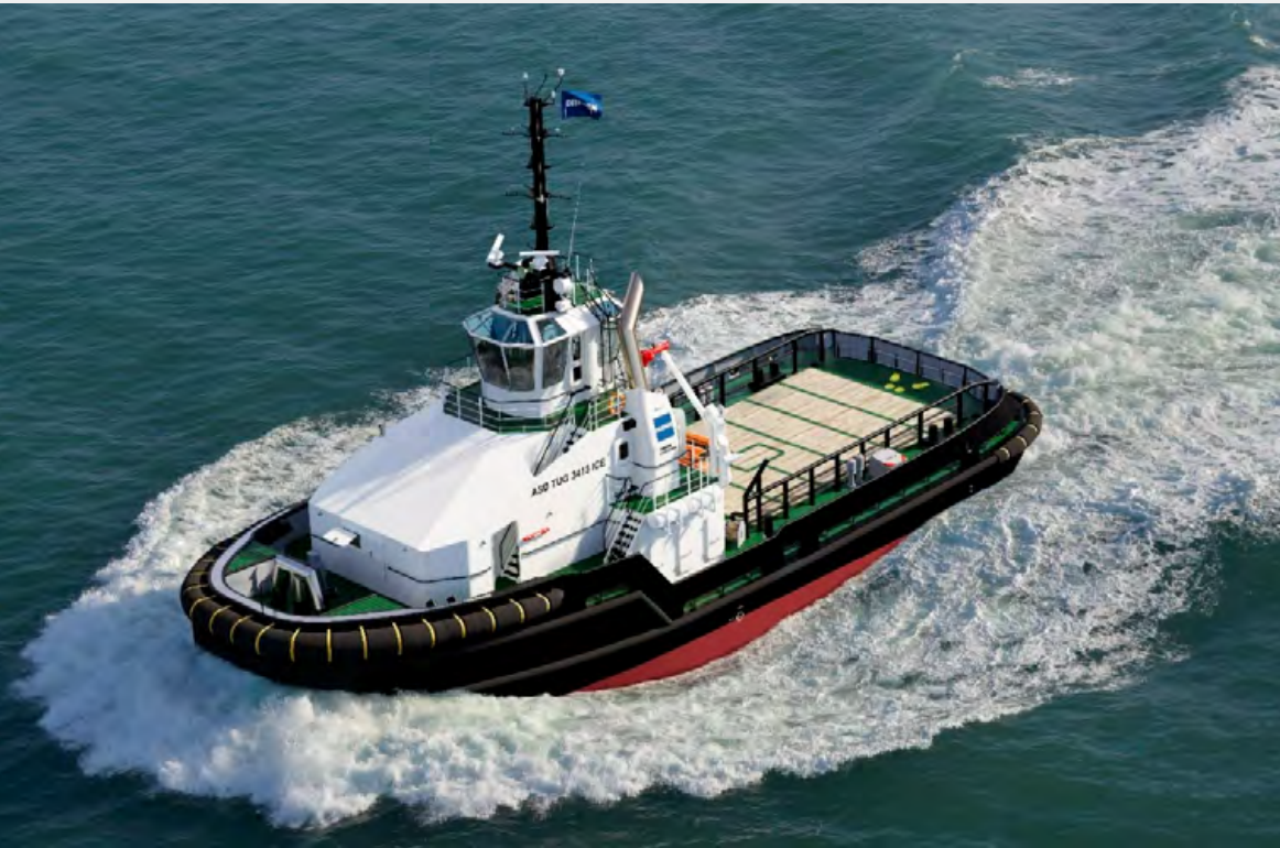
ASD 3413 YN 512801 (2021)

CUSTOMER: Damen Shipyards Gorinchem TYPE: Ice Tug(34 m) TYPE OF WORK: Newbuild SCOPE OF SUPPLY: Switchboards