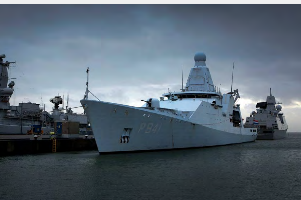
Zr. Ms. Zeeland (2013)

CUSTOMER: Damen Schelde Naval Shipbuilding TYPE: Joint Logistic Support Ship (204.7 m) TYPE OF WORK: Newbuild SCOPE OF SUPPLY: Installation of the electrical systems including command & control, PDU and production of 44 consoles.