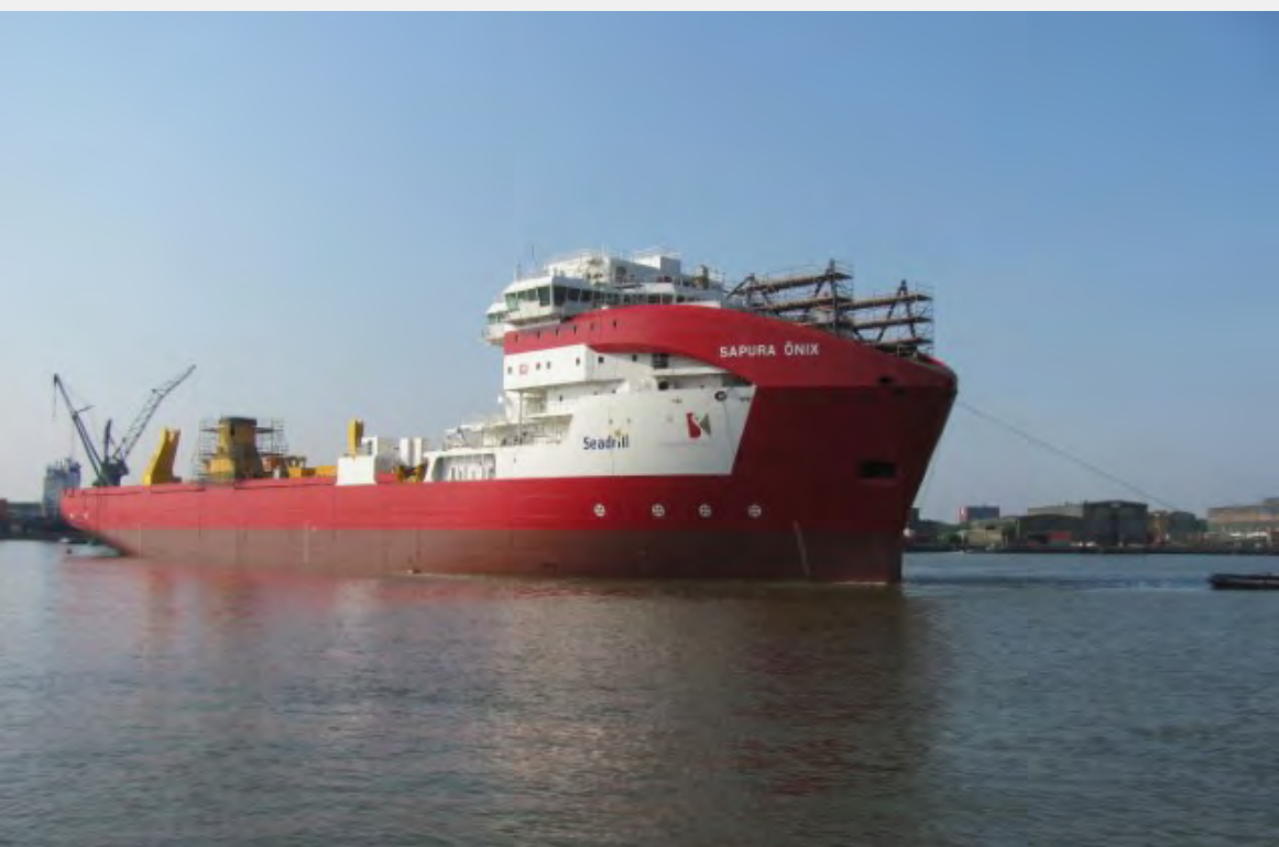
Sapura Onix (2015)

CUSTOMER: IHC Offshore & Marine TYPE: Pipe Laying Support Vessel (145 m) TYPE OF WORK: Newbuild SCOPE OF SUPPLY: System Integration, complete electrical installation.