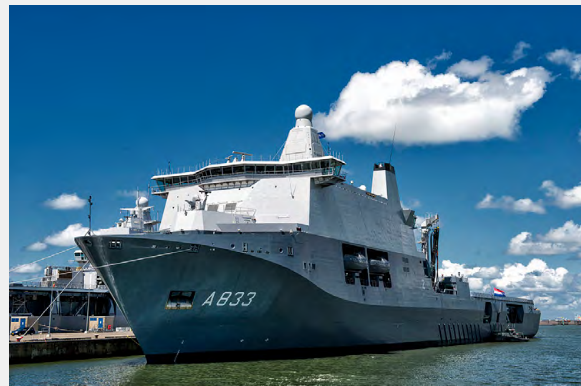
Zr. Ms. Karel Doorman (2015)

CUSTOMER: Damen Shipyards Gorinchem TYPE: Offshore Patrol Vessel (55 m) TYPE OF WORK: Newbuild SCOPE OF SUPPLY: Electrical package delivery. Engineering, installing and commissioning.