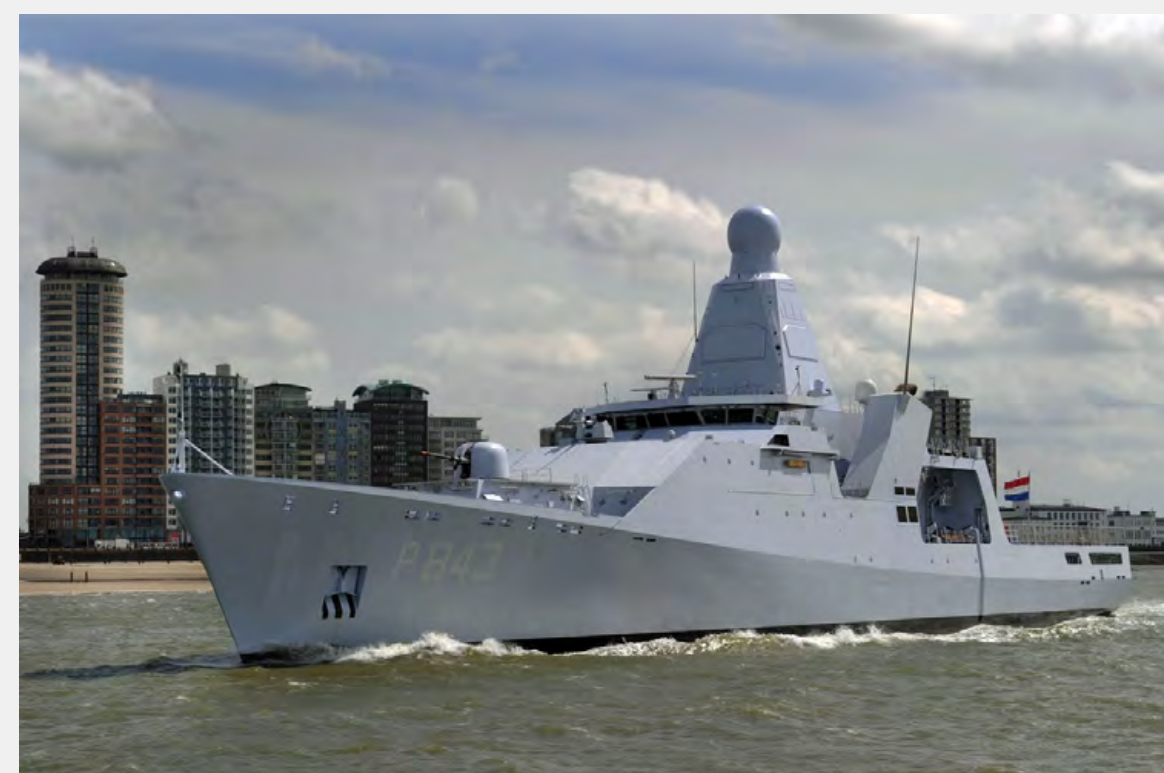
Zr. Ms. Groningen (2013)

CUSTOMER: Damen Schelde Naval Shipbuilding TYPE: Offshore Patrol Vessel (108.4 m) TYPE OF WORK: Newbuild SCOPE OF SUPPLY: Complete electrical systems integration, installing, supervising on site and commissioning.