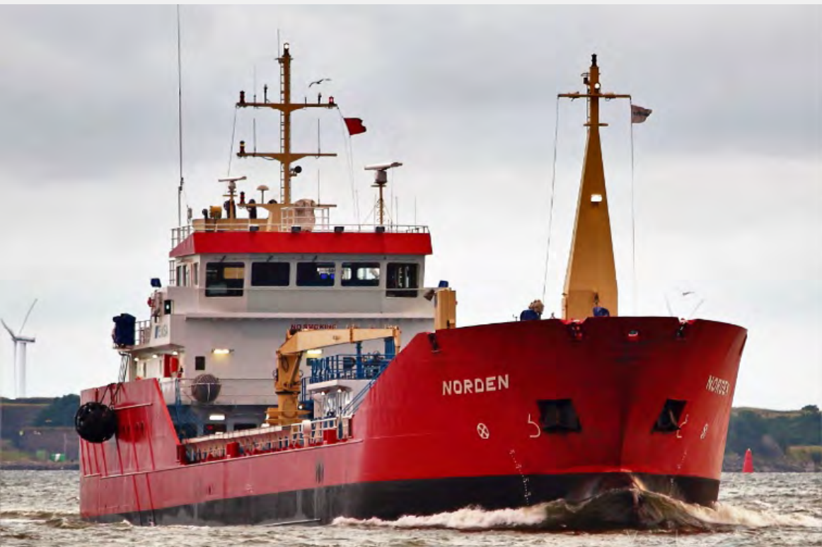
MT Norden (2006)

CUSTOMER: Bodewes Shipyards Hoogezand TYPE: 2.850 m³ oil tanker TYPE OF WORK: Newbuild SCOPE OF SUPPLY: Engineering, installation and commissioning of complete electrical installation, including alarm, monitoring and control systems, electrical distribution systems.