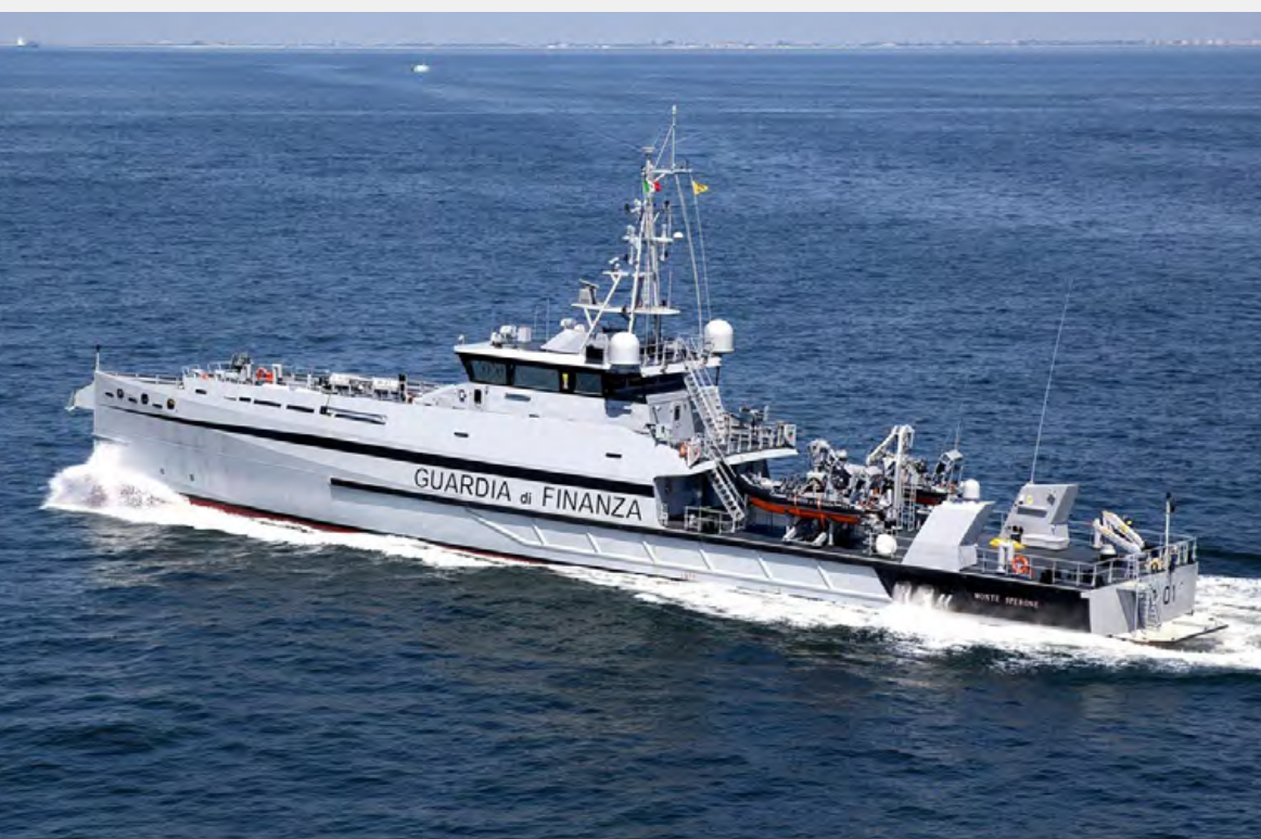
Stan Patrol 5509 (2015)

CUSTOMER: Damen Shiprepair Dunkerque TYPE: Research Vessel (50.9 m) TYPE OF WORK: Refit SCOPE OF SUPPLY: Life time extension. Electrical Installation.