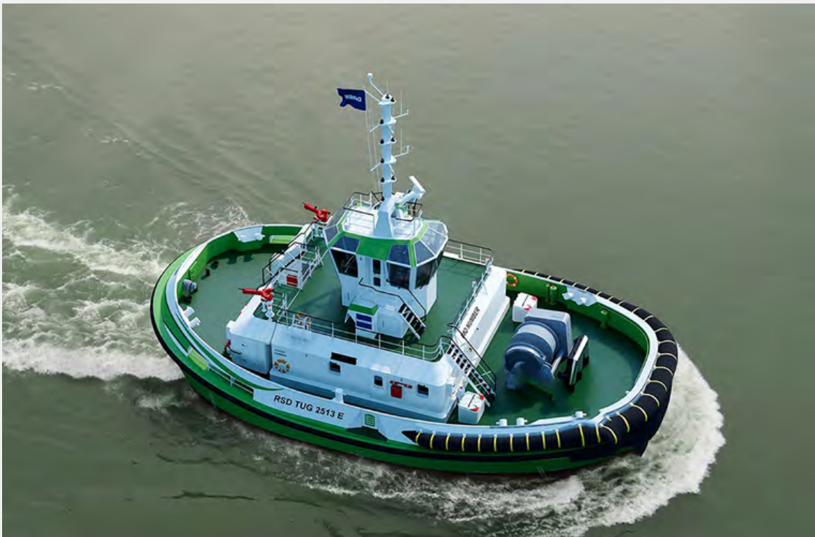
RSD2513 YN515011-16 (2020)

CUSTOMER: Damen Shipyards Gorinchem TYPE: Tug boat (23 m) TYPE OF WORK: Newbuild SCOPE OF SUPPLY: Switchboards and consoles.