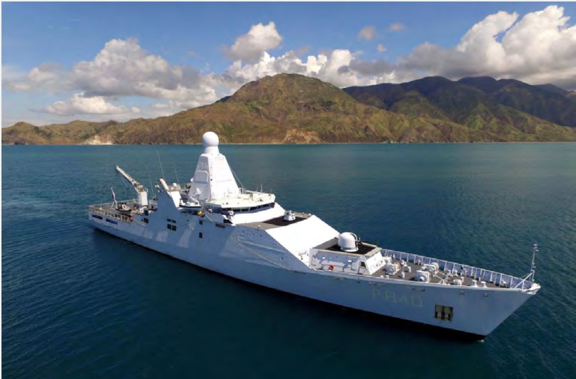
Zr. Ms. Holland (2012)

CUSTOMER: Damen Schelde Naval Shipbuilding TYPE: Offshore Patrol Vessel (108.4 m) TYPE OF WORK: Newbuild SCOPE OF SUPPLY: Complete electrical systems integration, installing, supervising on site and commissioning.