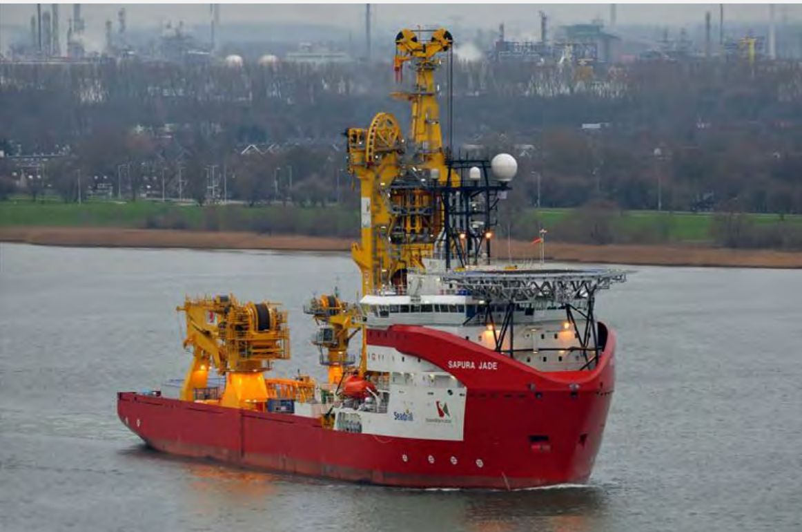
Sapura Jade (2016)

CUSTOMER: Damen Galați TYPE: Cable Layer (138 m) TYPE OF WORK: Newbuild SCOPE OF SUPPLY: System Integration, complete electrical installation; alarm, monitoring and control system; power distribution system.