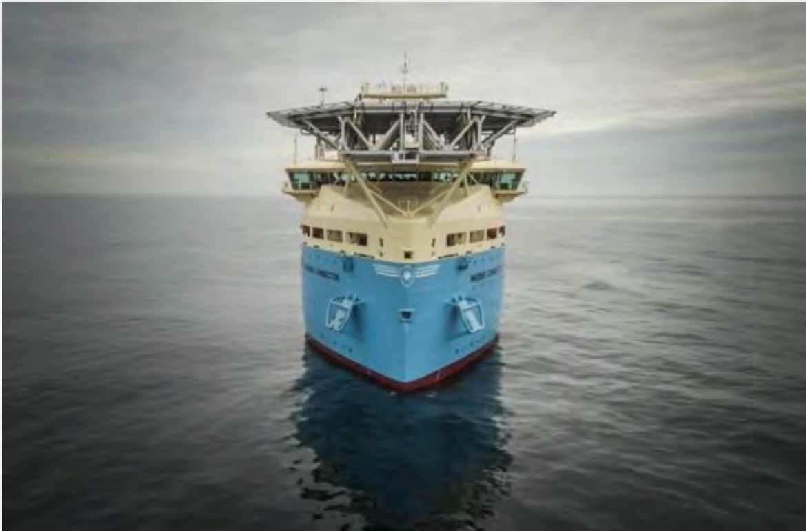
Maersk Connector (2016)

CUSTOMER: Fassmer TYPE: Research & Survey vessel (72 m) TYPE OF WORK: Newbuild SCOPE OF SUPPLY: System integration, vessel automation, power distribution system; navigation and communication system, consoles.