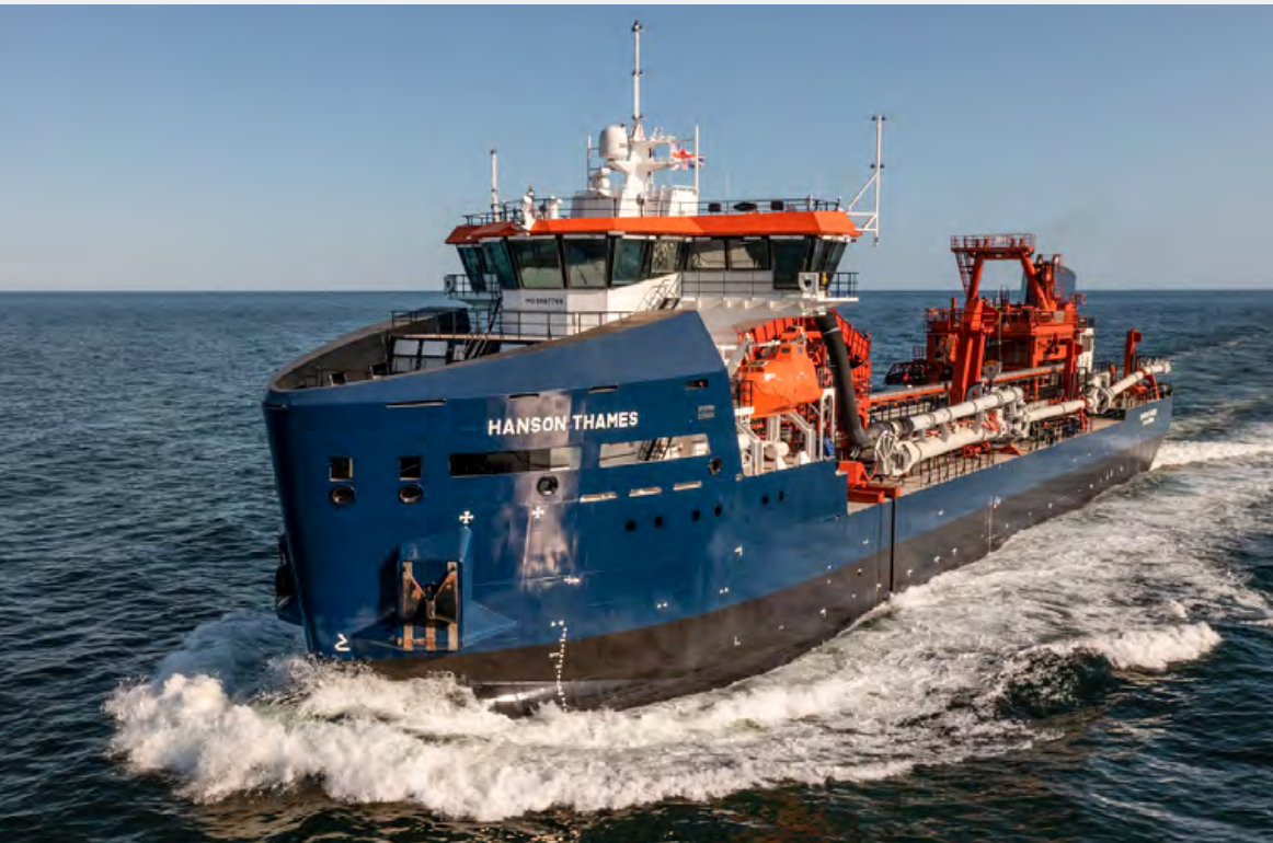
Hanson Thames, YN 563352 (2021)

CUSTOMER: Damen Shipyards Gorinchem, Galați TYPE: Marine Agregate Dredger 3500 (103 m) TYPE OF WORK: Newbuild SCOPE OF SUPPLY: Complete electrical engineering, cables & equipment delivery, complete installing and commissioning works for shaft generators, power management and power distribution system, alarm monitoring and control system, dredging control system, fire detection system, motor starters, etc.