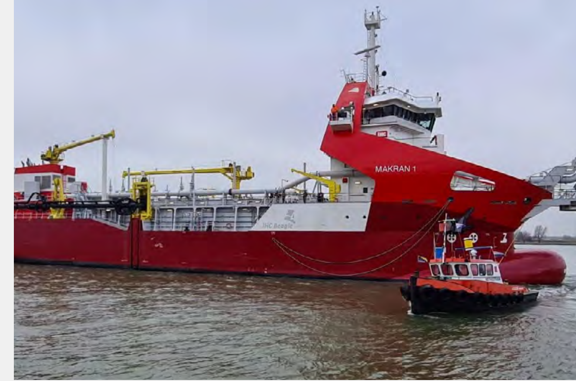
Makran 1&2, YN1301/02 (2021)

CUSTOMER: Damen Shipyards Gorinchem, Galați TYPE: Marine Agregate Dredger 3500 (103 m) TYPE OF WORK: Newbuild SCOPE OF SUPPLY: Complete electrical engineering, cables & equipment delivery, complete installing and commissioning works for shaft generators, power management and power distribution system, alarm monitoring and control system, dredging control system, fire detection system, motor starters, etc.