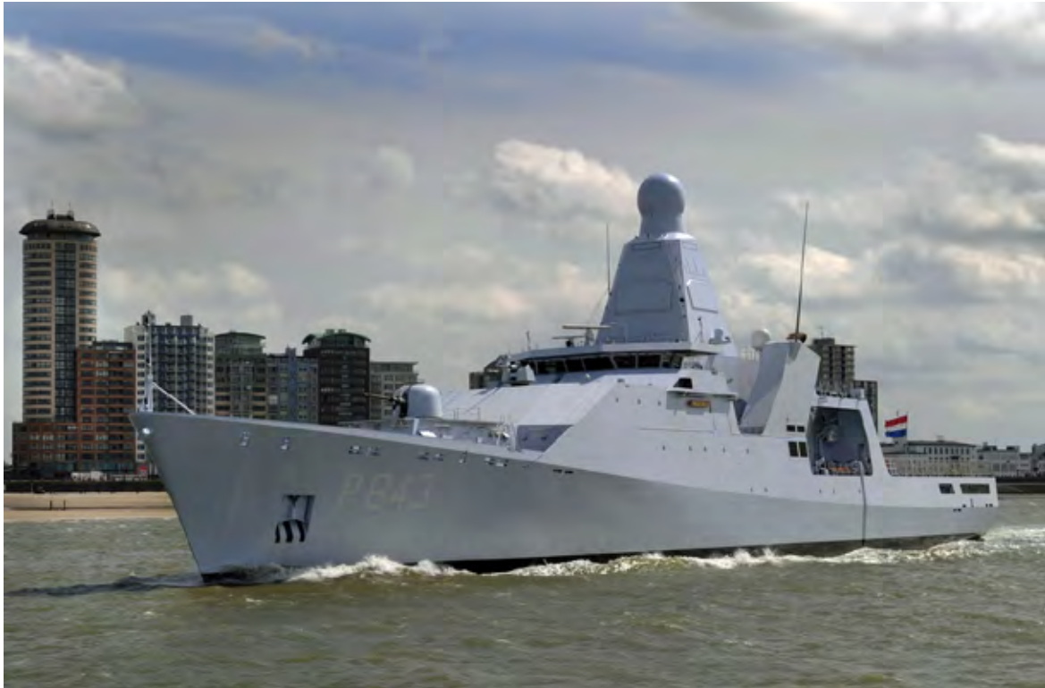
Zr. Ms. Groningen (2013)

CUSTOMER: Damen Schelde Naval Shipbuilding TYPE: Offshore Patrol Vessel (108.4 m) TYPE OF WORK: Newbuild SCOPE OF SUPPLY: Complete electrical systems integration, installing, supervising on site and commissioning.