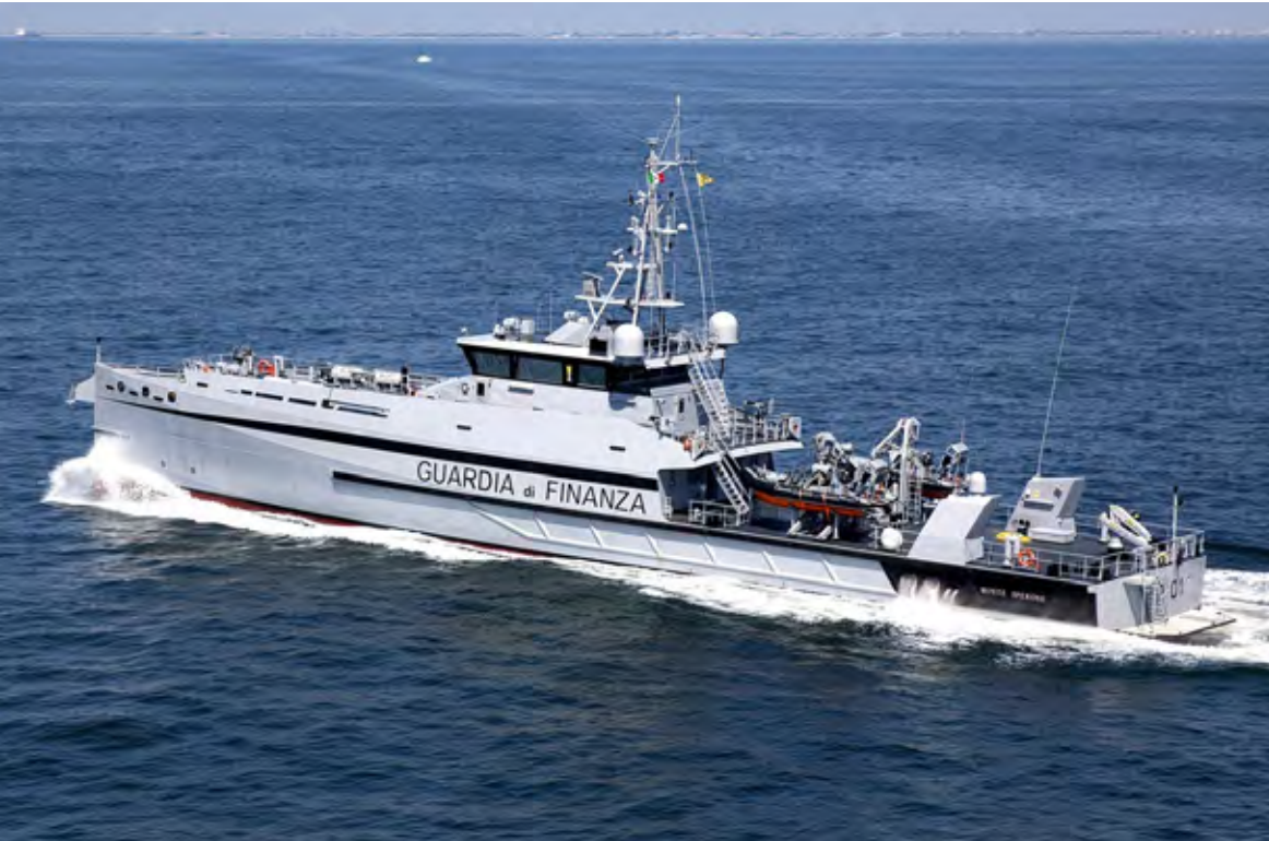
Stan Patrol 5509 (2015)

CUSTOMER: Damen Shiprepair Dunkerque TYPE: Research Vessel (50.9 m) TYPE OF WORK: Refit SCOPE OF SUPPLY: Life time extension. Electrical Installation.