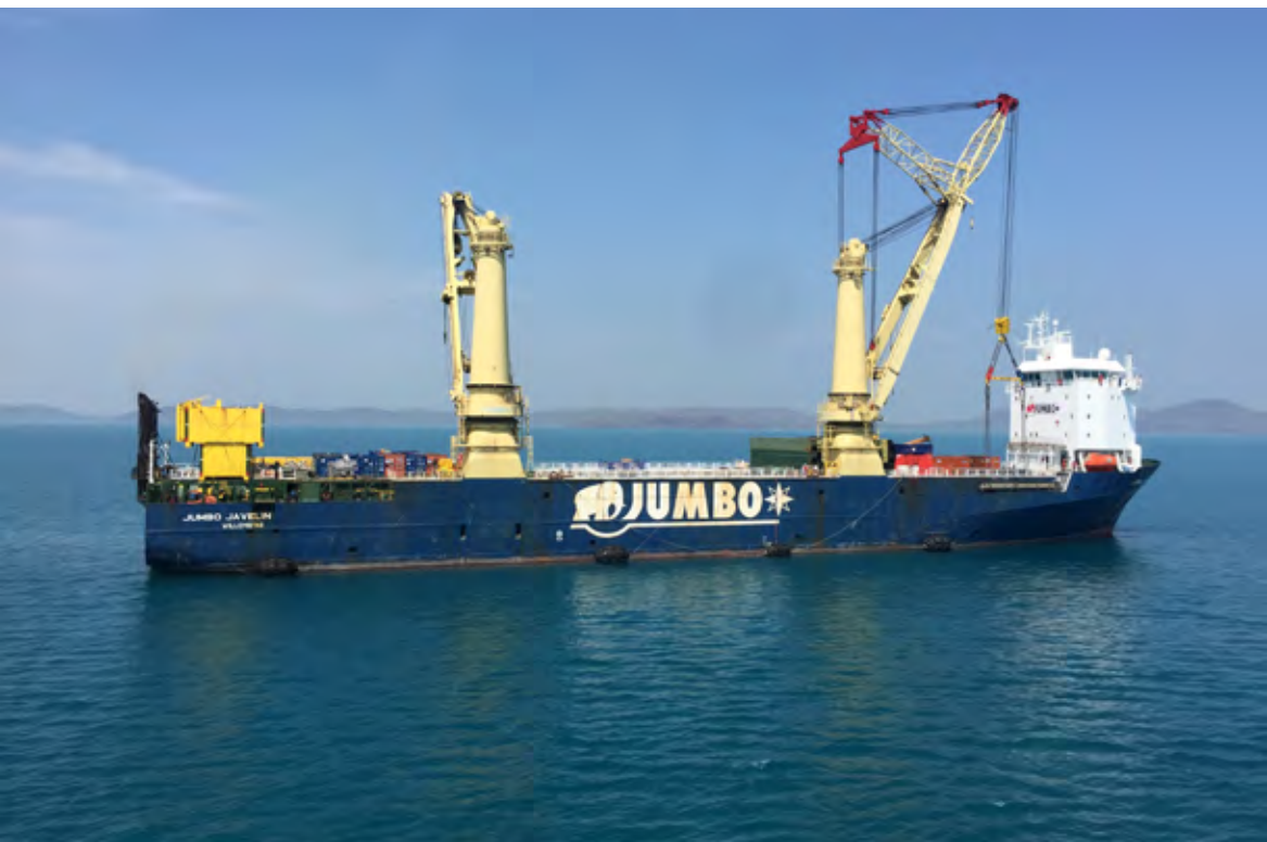
Jumbo Javelin (2020)

CUSTOMER: Damen Shiprepair Rotterdam TYPE: Oceanographic Survey Vessel (85.3 m) TYPE OF WORK: Refit SCOPE OF SUPPLY: Electrical outfitting, update DP (dp 2), upgrade bridge system, farsounder, panels, shore connection, lighting system (lutron/pharos), pulling and terminating 205km cables.