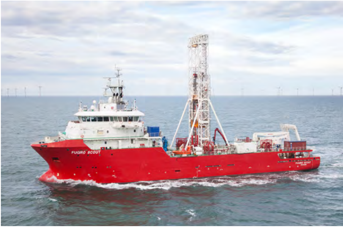
Fugro Venturer (2017)

CUSTOMER: Damen Shipyards Gorinchem TYPE: Modular Dry Dock (81 m) TYPE OF WORK: Newbuild SCOPE OF SUPPLY: Infrastructure (cable routing, cable trays), switchboards and consoles.