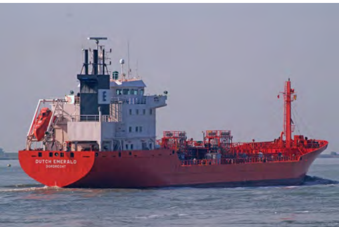
Dutch Emerald (2000)

CUSTOMER: VEKA Shipyard Lemmer TYPE: Chemical oil product tanker TYPE OF WORK: Newbuild SCOPE OF SUPPLY: Engineering, installation and commissioning of complete electrical installation, including alarm, monitoring and control systems, electrical distribution systems, power management system.