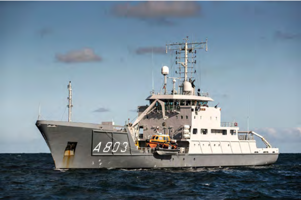
Zr. Ms. Luymes (2020)

CUSTOMER: R+S TYPE: Hydrographic Research Vessel (80 m) TYPE OF WORK: Refit SCOPE OF SUPPLY: Modifications PABX.