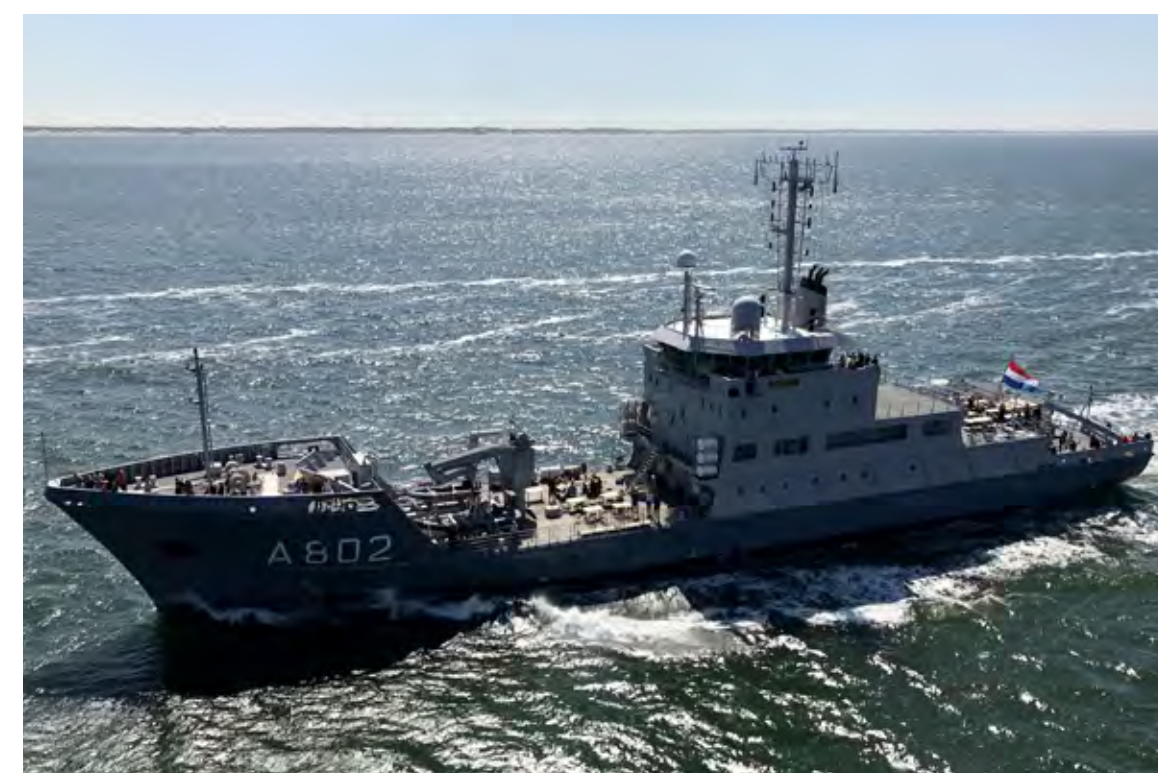
Zr. Ms. Snellius (2020)

CUSTOMER: Damen Shipyard Den Helder TYPE: Naval Auxiliary Vessel (65 m) TYPE OF WORK: Refit SCOPE OF SUPPLY: Mid-Life upgrade and maintenance.