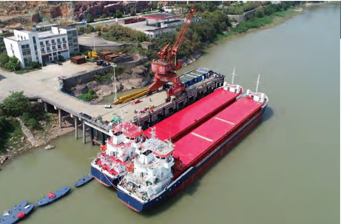
Combi Freighter 3850m 2 (2019)

CUSTOMER: Severnav Shipyard TYPE: 6500 m 3 liquefied gas tanker and 8600 m 3 gas tankers TYPE OF WORK: Newbuild SCOPE OF SUPPLY: Complete electrical package, including engineering, commissioning, alarm, monitoring and control systems.