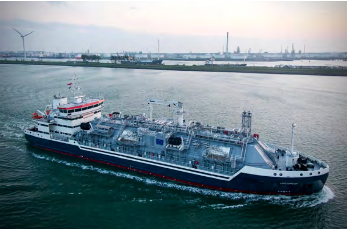
Optimus YN 559014 (2021)

CUSTOMER: Damen Shipyards Gorinchem, Yichang TYPE: Liquefied Gas Carrier (LGC) 6000 LNG s, Bunkering vessel (100 m) TYPE OF WORK: Newbuild SCOPE OF SUPPLY: Electrical Engineering and Integration, Equipment delivery, Supply and supervising of loose equipment and cables, Commissioning.