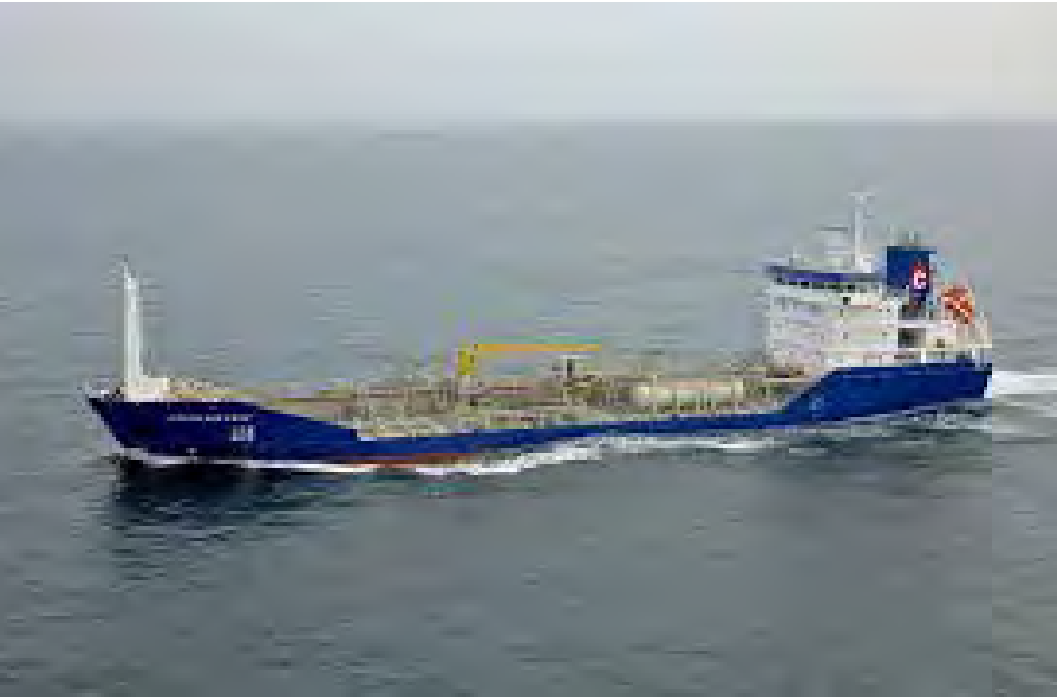
Coolwater and Capewater (2008)

CUSTOMER: Damen Shipyards Gorinchem TYPE: stan tanker 5412 TYPE OF WORK: Newbuild SCOPE OF SUPPLY: Complete electrical package (engineering, installing, commissioning, alarm, monitoring and control systems, internal communication systems, CCTV system).