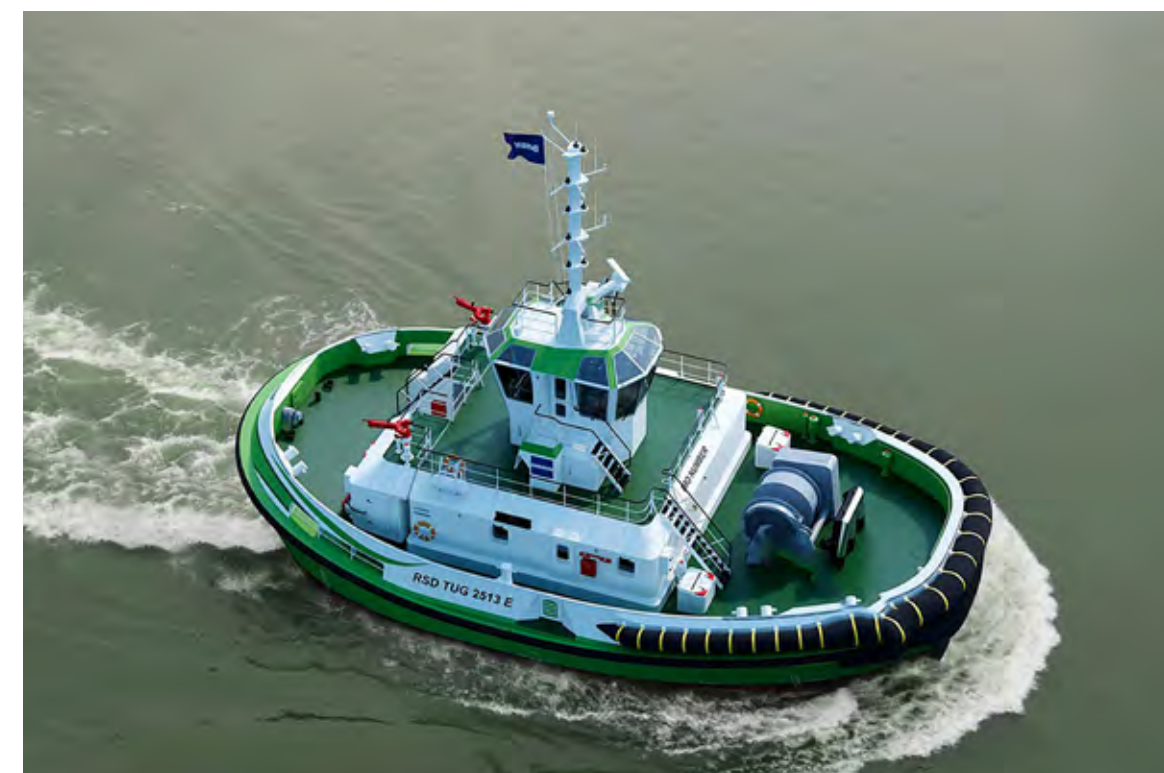
RSD2513 YN515011-16 (2020)

CUSTOMER: Damen Shipyards Gorinchem TYPE: Tug boat (23 m) TYPE OF WORK: Newbuild SCOPE OF SUPPLY: Switchboards and consoles.