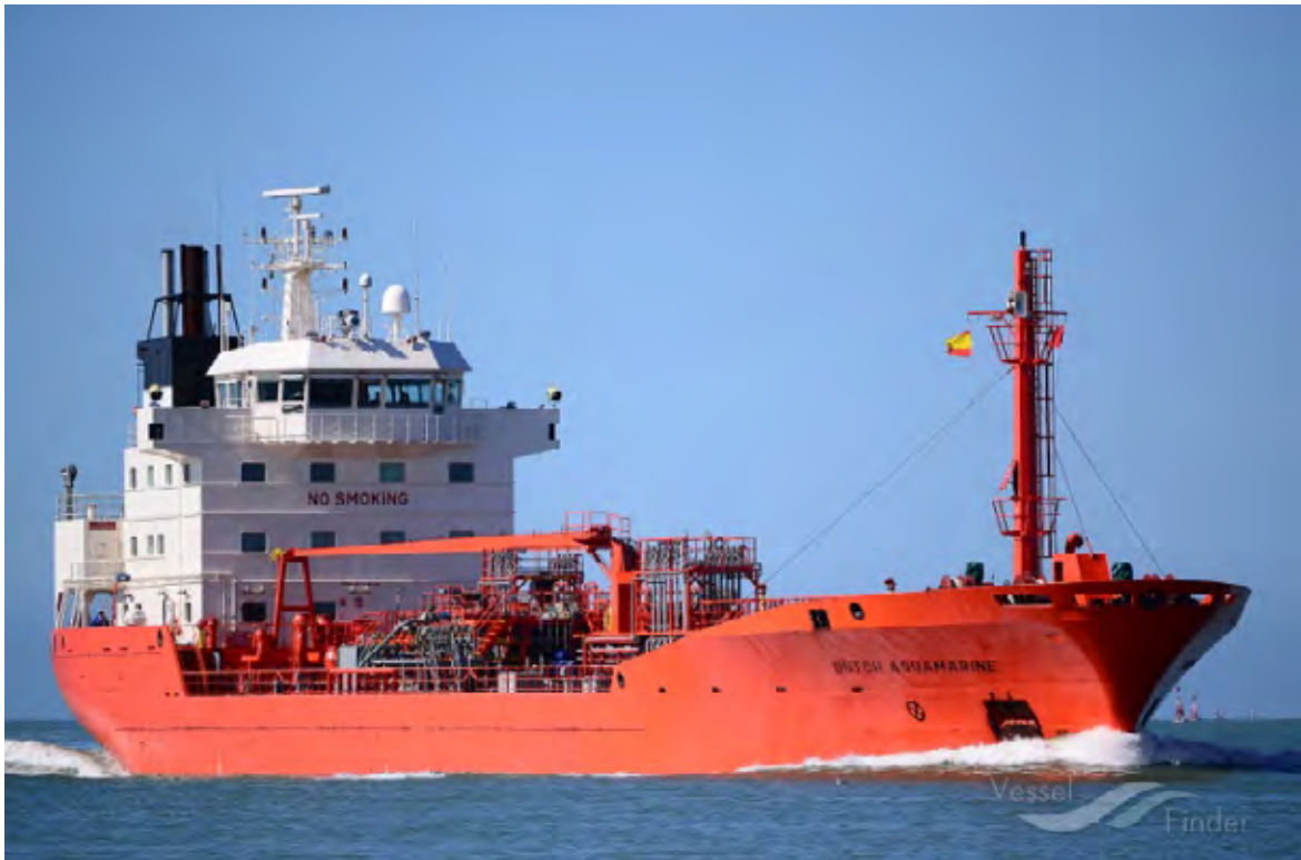
Dutch Aqua Marine (2000)

CUSTOMER: VEKA Shipyard Lemmer TYPE: Bitumen tanker TYPE OF WORK: Newbuild SCOPE OF SUPPLY: Engineering, installation and commissioning of complete electrical installation, including alarm, monitoring and control systems, electrical distribution systems, power management system.