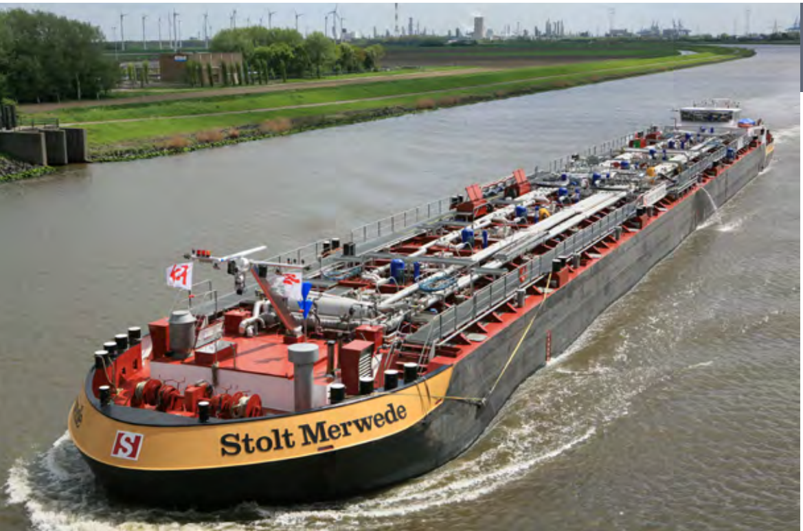
Stolt Waal, Main, Maas, Mosel, Rhine and Merwede (2018)

CUSTOMER: Damen Shipyards Gorinchem TYPE: 8.000 m 3 oil tankers TYPE OF WORK: Newbuild SCOPE OF SUPPLY: Eengineering, installation and commissioning of complete electrical installation, alarm, monitoring and control systems, electrical distribution systems.