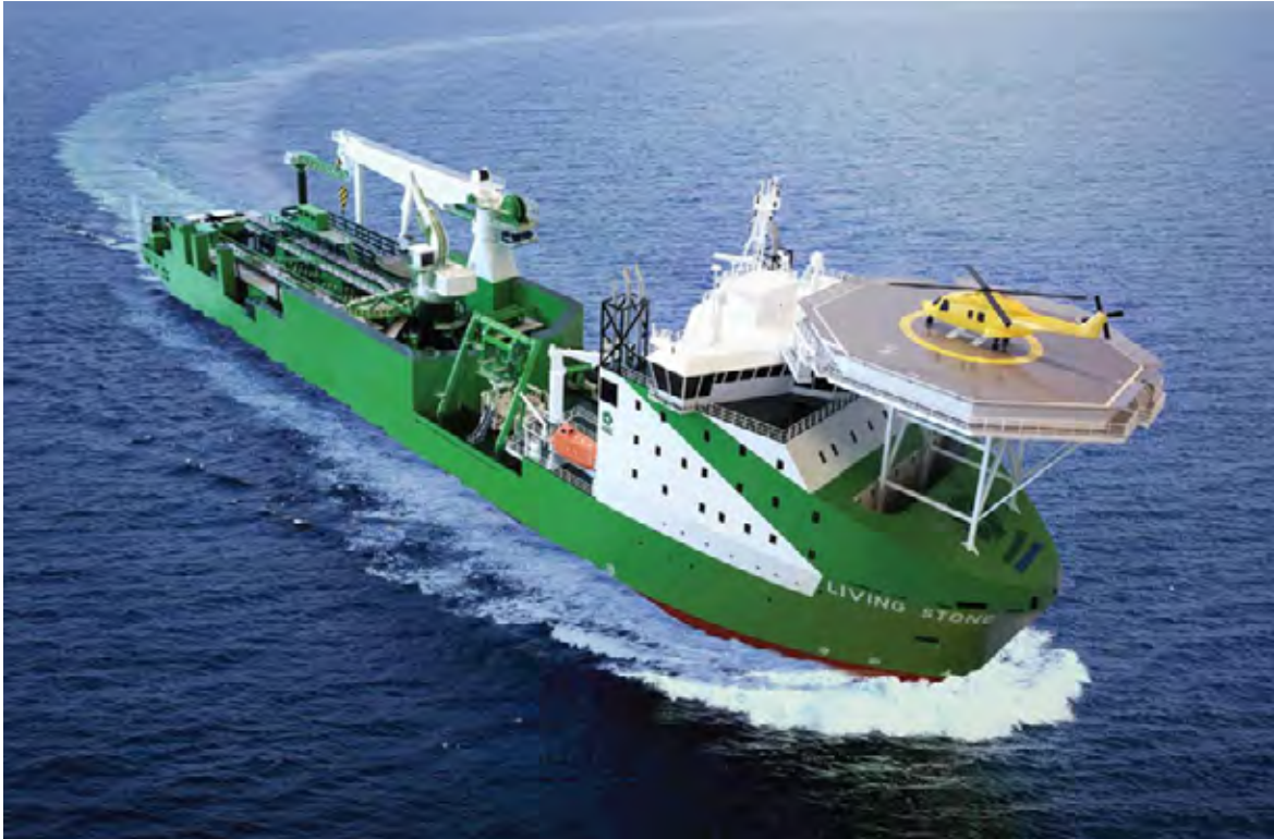
Living Stone (2018)

CUSTOMER: DEME TYPE: Jack-Up Vessel (89 m) TYPE OF WORK: Refit SCOPE OF SUPPLY: Installation Helideck.