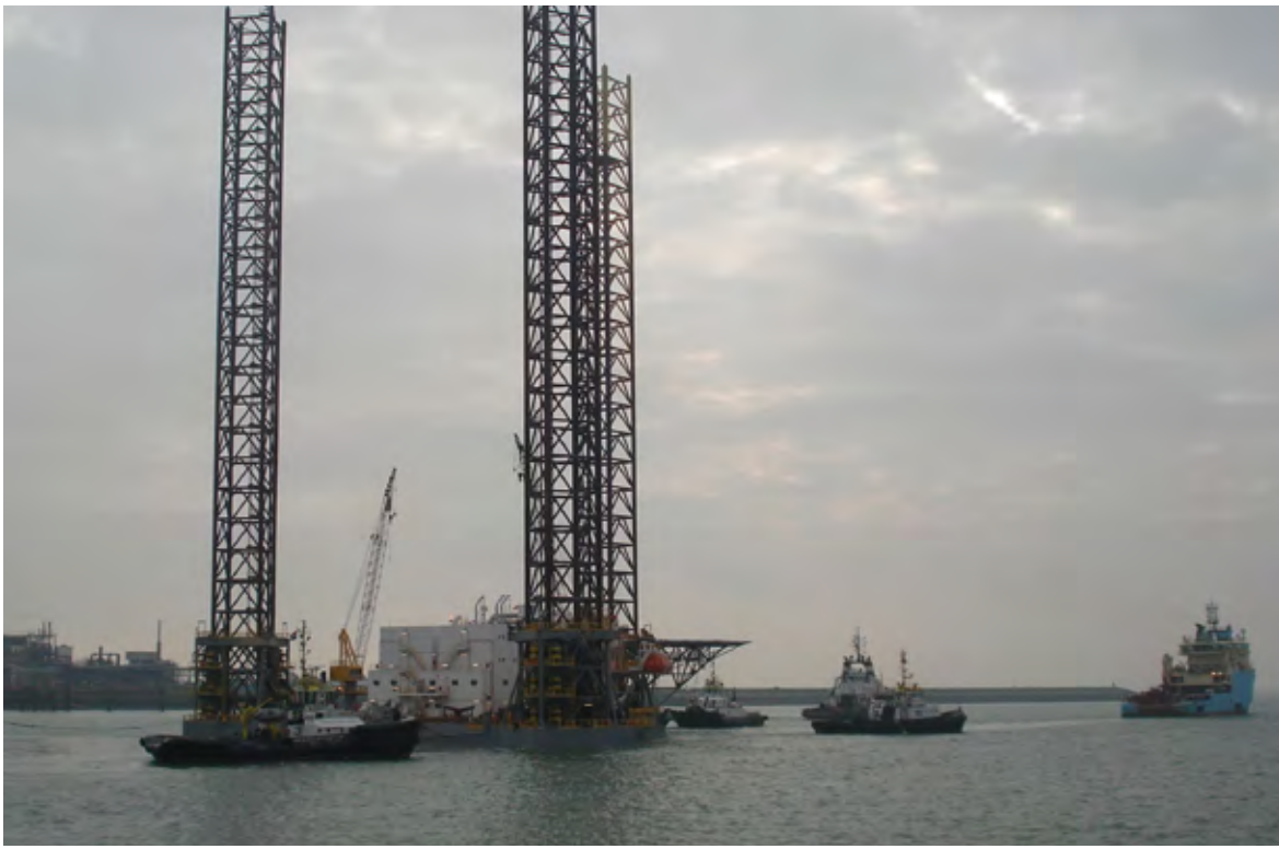
Atlantic Labrador (2012)

CUSTOMER: OOS TYPE: Semi submersible crane vessel (137 m) TYPE OF WORK: Service SCOPE OF SUPPLY: Modifications to navigation and communication system.