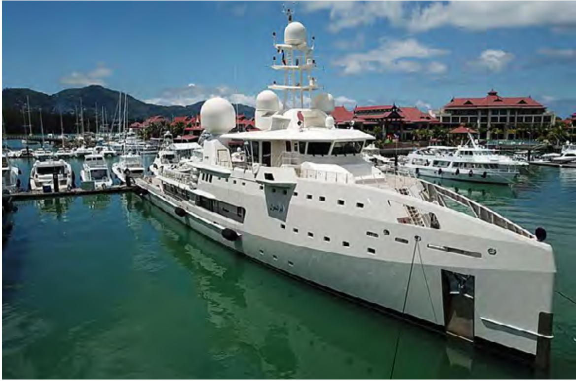
Al Adaam (2013)

CUSTOMER: Cyrus Yachts Antalya TYPE: Sailing Yacht (22 m) TYPE OF WORK: Newbuild SCOPE OF SUPPLY: Electrical Package Delivery.