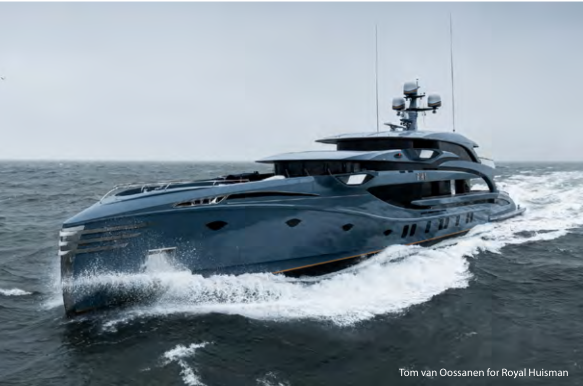
Tom van Oossanen for Royal Huisman

CUSTOMER: Royal Huisman TYPE: Motor Yacht (58.5 m) TYPE OF WORK: Newbuild SCOPE OF SUPPLY: Entertainment system.