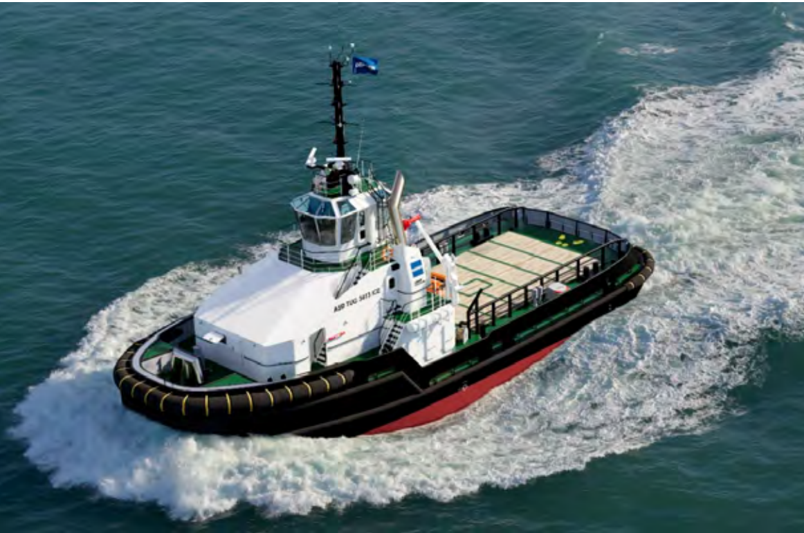
ASD 3413 YN 512801 (2021)

CUSTOMER: Damen Shipyards Gorinchem TYPE: Ice Tug(34 m) TYPE OF WORK: Newbuild SCOPE OF SUPPLY: Switchboards