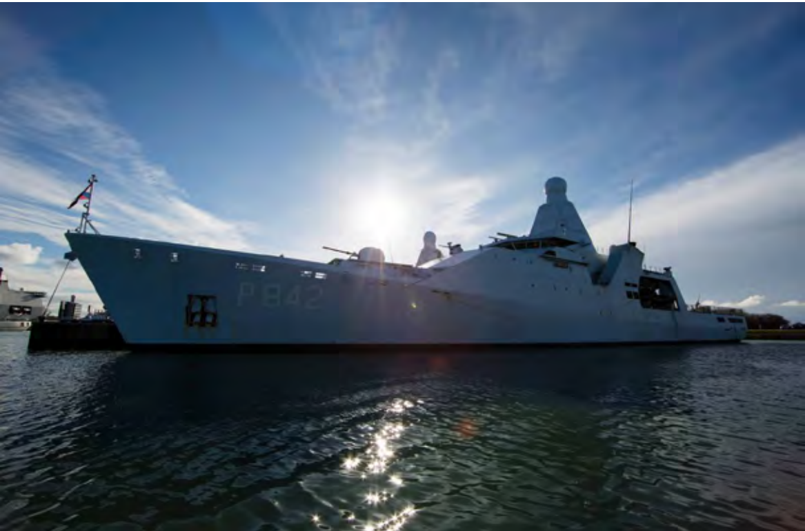
Zr. Ms. Friesland (2013)

CUSTOMER: Damen Schelde Naval Shipbuilding TYPE: Offshore Patrol Vessel (108.4 m) TYPE OF WORK: Newbuild SCOPE OF SUPPLY: Complete electrical systems integration, installing, supervising on site and commissioning.