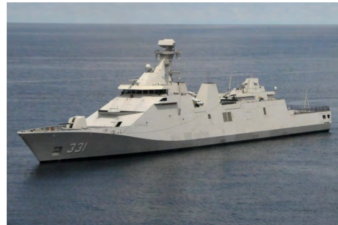
KRI Raden Eddy Martadinata (2017)

CUSTOMER: Damen Shiprepair Vlissingen TYPE: Research Vessel (60 m) TYPE OF WORK: Refit SCOPE OF SUPPLY: Life time extension. Electrical Installation and Nautical System.