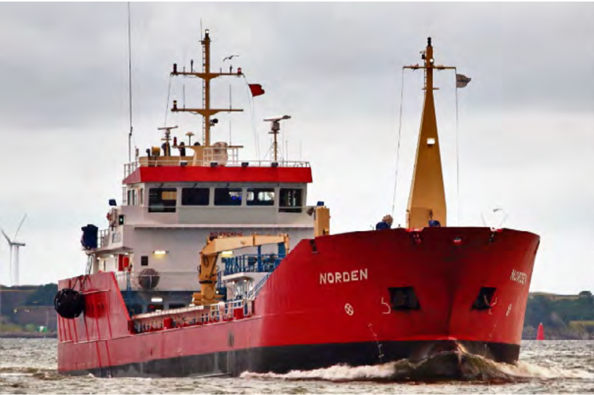
MT Norden (2006)

CUSTOMER: Bodewes Shipyards Hoogezand TYPE: 2.850 m³ oil tanker TYPE OF WORK: Newbuild SCOPE OF SUPPLY: Engineering, installation and commissioning of complete electrical installation, including alarm, monitoring and control systems, electrical distribution systems.