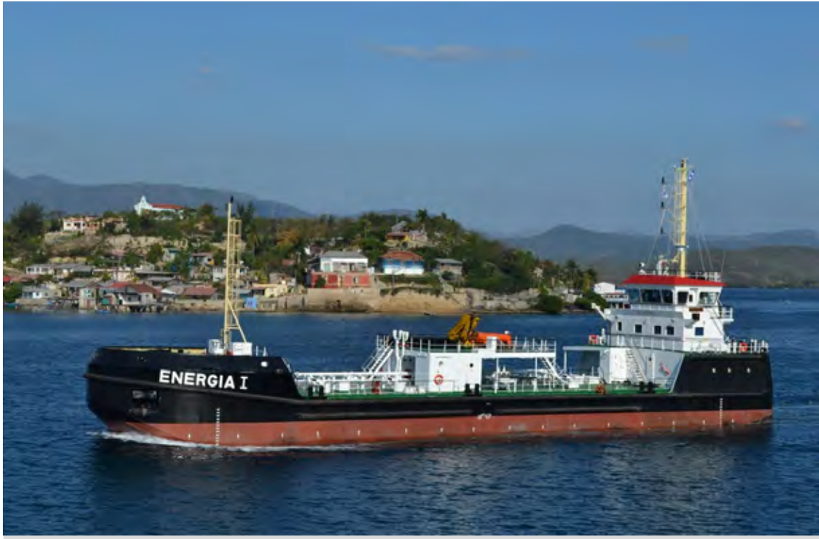
Energia I (2015)

CUSTOMER: Various shipyards TYPE: Chemical sea tankers TYPE OF WORK: Newbuild SCOPE OF SUPPLY: Service.