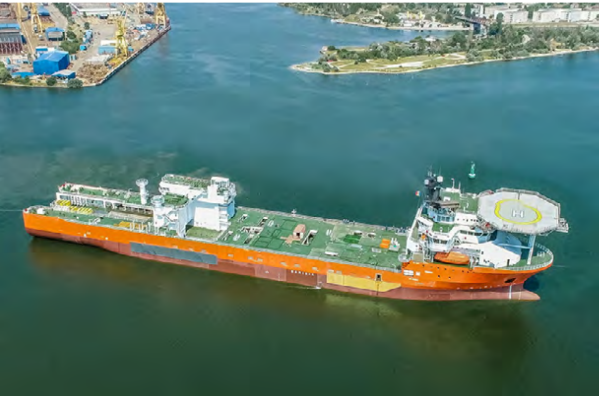
Benguela Gem, YN 594001 (2021)

CUSTOMER: Damen Shipyard Mangalia TYPE: Offshore diamond recovery vessel (176.5 m) TYPE OF WORK: Newbuild SCOPE OF SUPPLY: Supply and installation of loose equipment and cables.