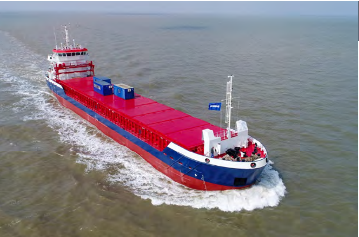
Sophie & Benabell G. YN 559012-13 (2021)

CUSTOMER: Damen Shipyards Gorinchem, Yichang TYPE: Liquefied Gas Carrier (LGC) 6000 LNG s, Bunkering vessel (100 m) TYPE OF WORK: Newbuild SCOPE OF SUPPLY: Electrical Engineering and Integration, Equipment delivery, Supply and supervising of loose equipment and cables, Commissioning.