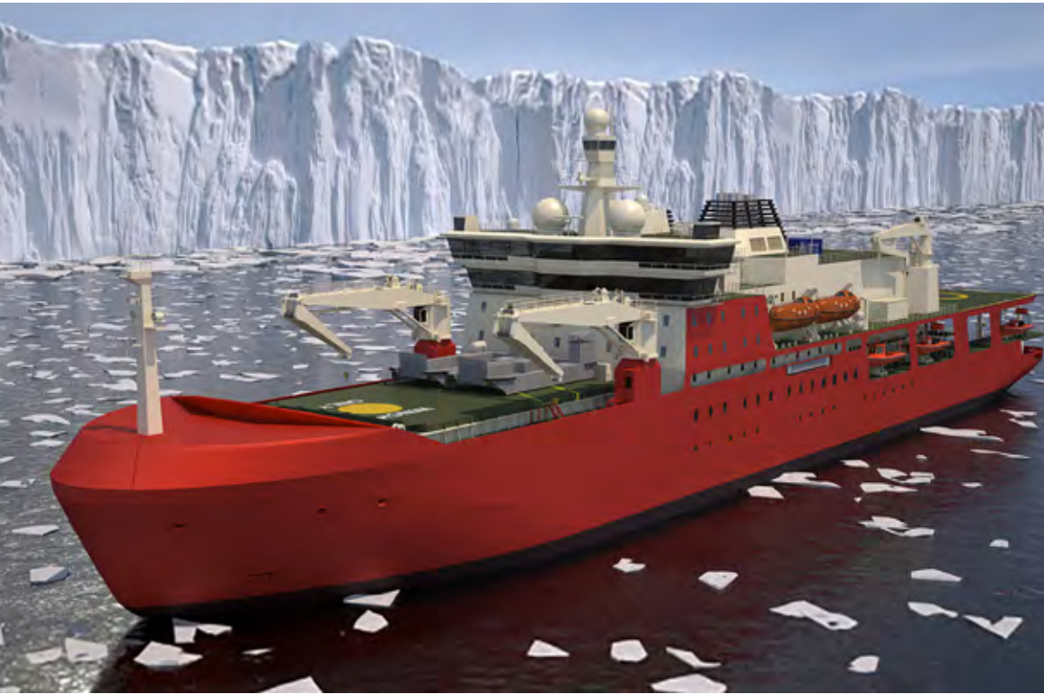
Nuyina, YN 417000 (2021)

CUSTOMER: Damen Schelde, Galați TYPE: ASRV Icebreaker, Research vessel (160 m) TYPE OF WORK: Newbuild SCOPE OF SUPPLY: Electrical Engineering and Integration, Equipment delivery, Supply and Installation of loose equipment and cables.