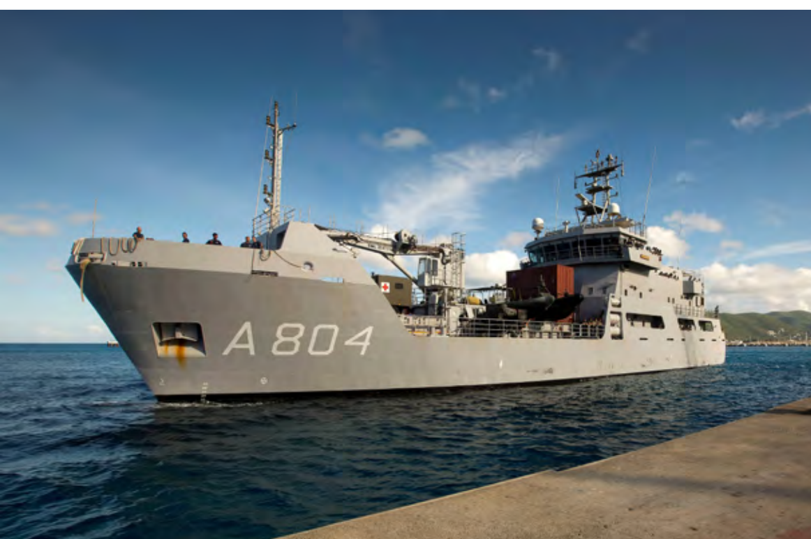
Zr. Ms. Pelikaan (2020)

CUSTOMER: Damen Schelde Naval Shipbuilding TYPE: Long Range Oceanic Patrol Vessel (107.5 m) TYPE OF WORK: Newbuild SCOPE OF SUPPLY: Complete electrical systems integration, installing, supervising on site and commissioning.