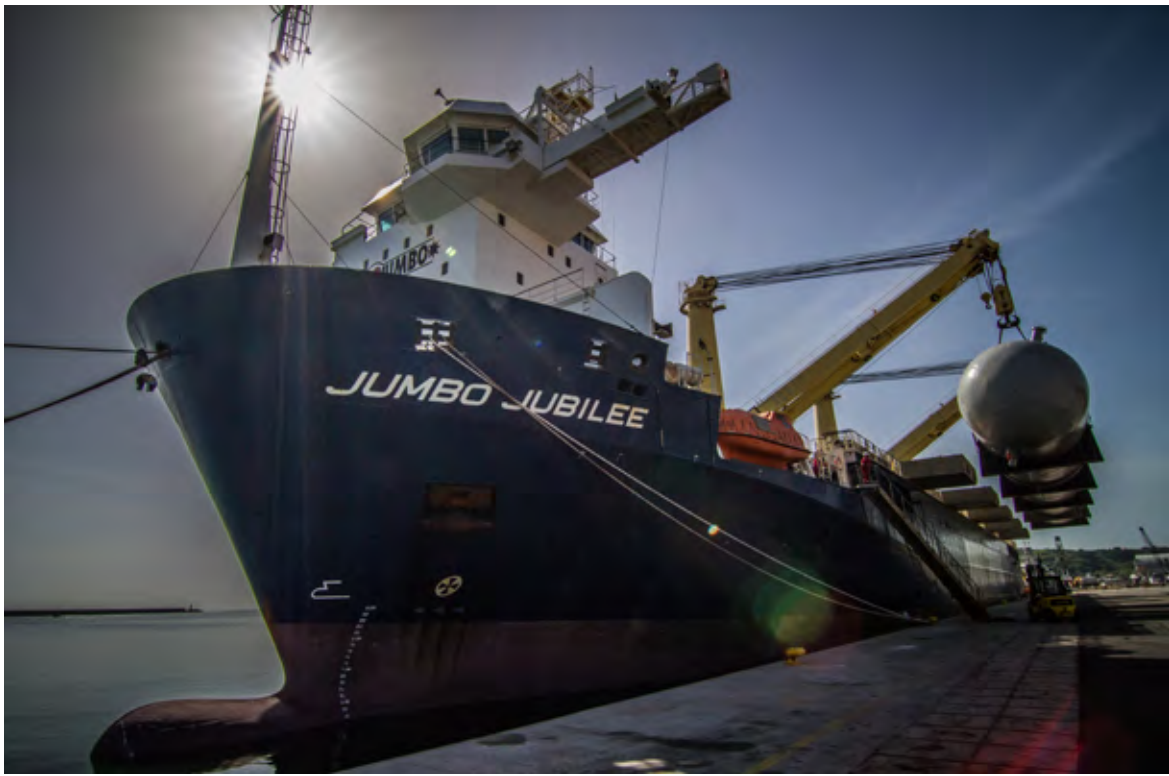
Jumbo Jubilee (2019)

CUSTOMER: Jumbo Maritime TYPE: Heavy Load Carrier (144 m) TYPE OF WORK: Service SCOPE OF SUPPLY: Engineering, production of additional distribution for 6 additional generators. Including modifications to AMCS and PMS.