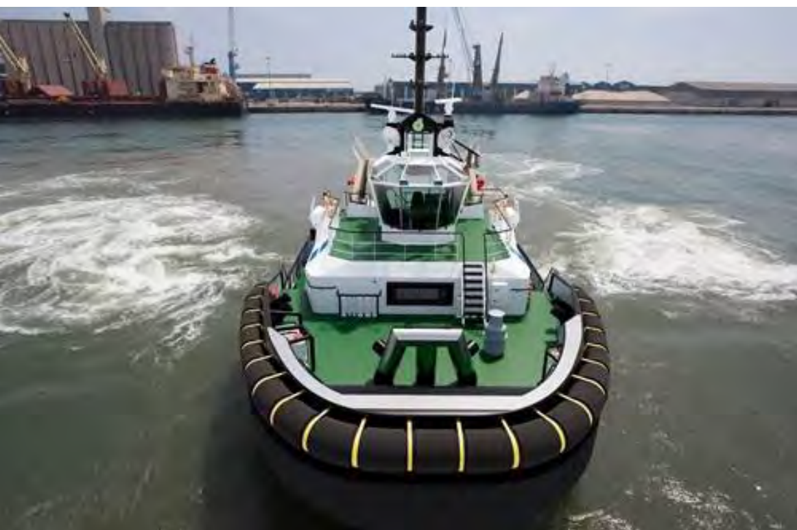
ASD2312 YN513605-10 (2020)

CUSTOMER: Damen Shipyards Gorinchem TYPE: Tug boat (28 m) TYPE OF WORK: Newbuild SCOPE OF SUPPLY: Switchboards and consoles.