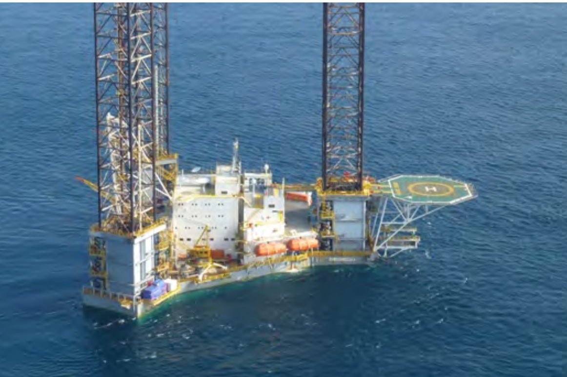
Atlantic London (2013)

CUSTOMER: OOS TYPE: Semi submersible accommodation platform (119 m) TYPE OF WORK: Service SCOPE OF SUPPLY: Modifications to navigation and communication system.