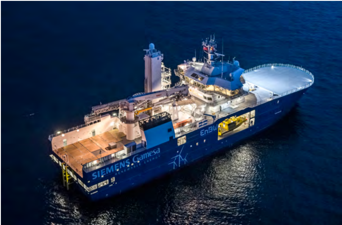
Bibby Wavemaster (2019)

CUSTOMER: Jumbo Maritime TYPE: Heavy Load Carrier (143.1 m) TYPE OF WORK: Service SCOPE OF SUPPLY: Refit AMCS, (network, PLC, SCADA).