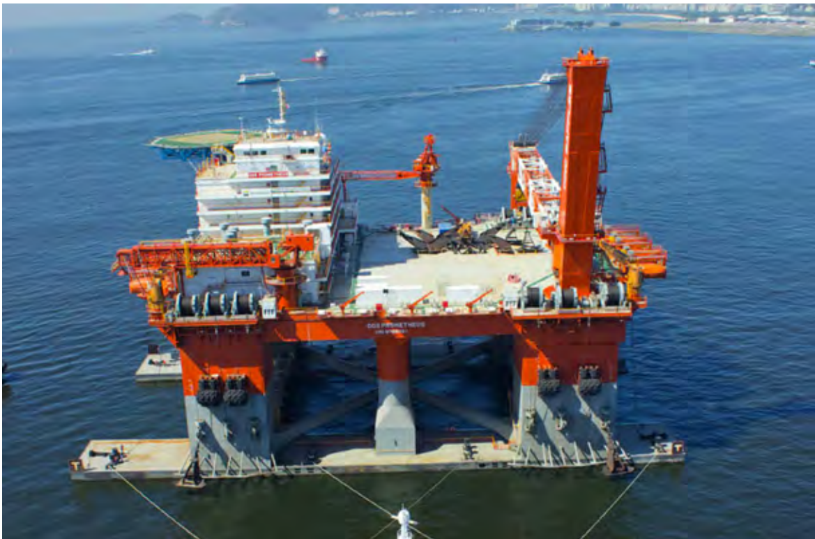
OOS Promotheus (2013)

CUSTOMER: Damen Shiprepair Vlissingen TYPE: Jack-Up Vessel (80 m) TYPE OF WORK: Refit SCOPE OF SUPPLY: Extension of legs including upgrade.