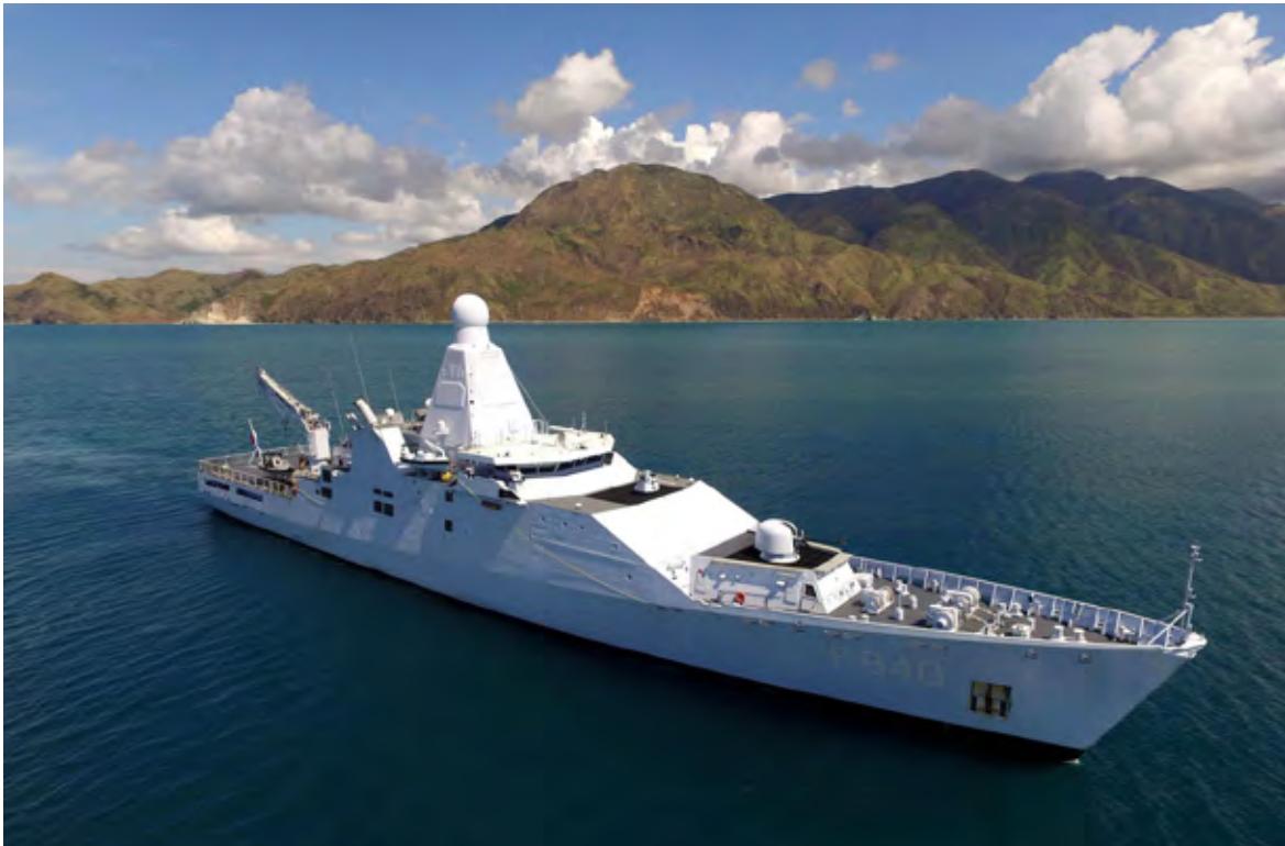
Zr. Ms. Holland (2012)

CUSTOMER: Damen Schelde Naval Shipbuilding TYPE: Offshore Patrol Vessel (108.4 m) TYPE OF WORK: Newbuild SCOPE OF SUPPLY: Complete electrical systems integration, installing, supervising on site and commissioning.