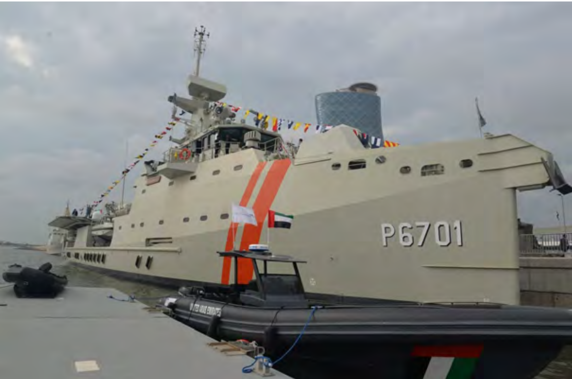
OPV 6711 UAE / Hmeem (2016)

CUSTOMER: Damen Shipyards Gorinchem TYPE: Offshore Patrol Vessel (67 m) TYPE OF WORK: Newbuild SCOPE OF SUPPLY: Electrical package delivery. Engineering, installing and commissioning.