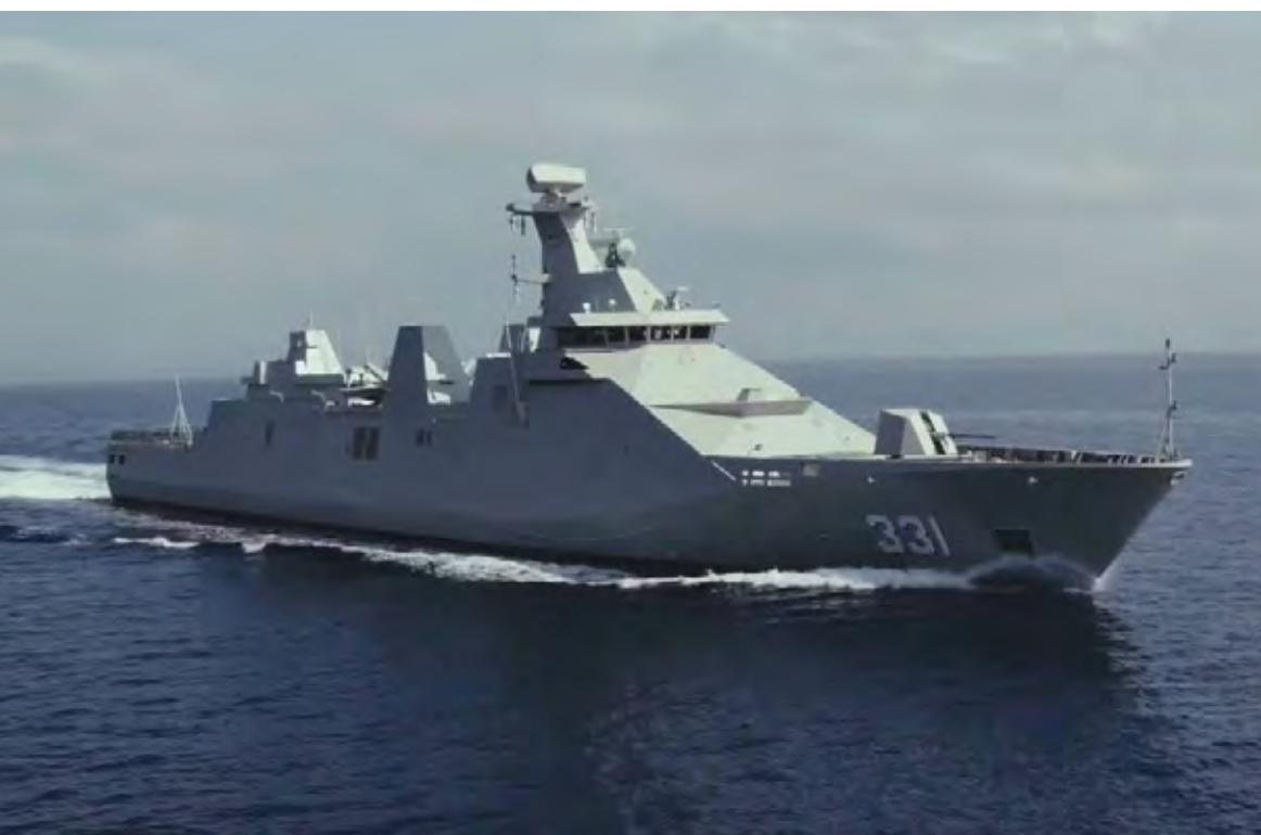
Gusti Ngurah Ra (2017)

CUSTOMER: Damen Schelde Naval Shipbuilding TYPE: Guided-missile Frigate (105.1 m) TYPE OF WORK: Newbuild SCOPE OF SUPPLY: Engineering and integration of platform system, materials and equipment/ system delivery, installing of cable and set to work activities.