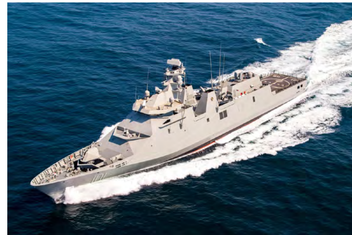
Arm Juarez (2020)

CUSTOMER: Damen Shipyards Gorinchem TYPE: Offshore Patrol Vessel 1900 (90 m) TYPE OF WORK: Newbuild SCOPE OF SUPPLY: Electrical package delivery. Engineering, installing, commissioning and supervision.