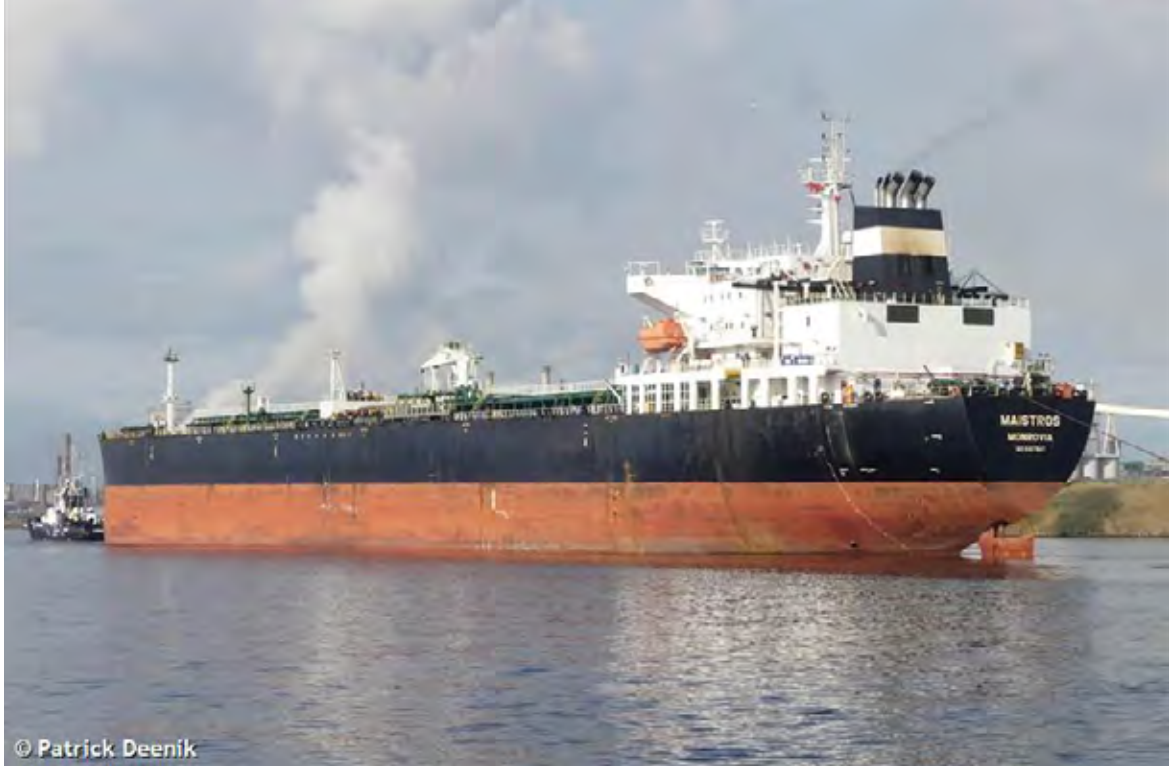
Maistros & Ostria (2007-2008)

CUSTOMER: Breko TYPE: 4900 dwt chemical tankers TYPE OF WORK: Newbuild SCOPE OF SUPPLY: Engineering, installation and commissioning of complete electrical installation, including alarm, monitoring and control systems, electrical distribution systems.