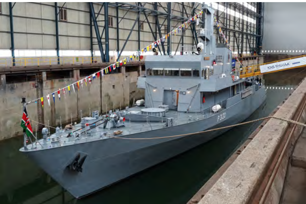
KNS Shujaa (2018)

CUSTOMER: DMI TYPE: Landing Platform Dock (166 m) TYPE OF WORK: Refit SCOPE OF SUPPLY: Modification electric installation hospital.