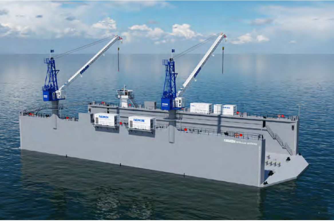
Modular Dry Dock 8026-4 (2017)

CUSTOMER: DEME TYPE: Cable Layer (161 m) TYPE OF WORK: Refit SCOPE OF SUPPLY: Infrastructure (cable routing, cable trays).