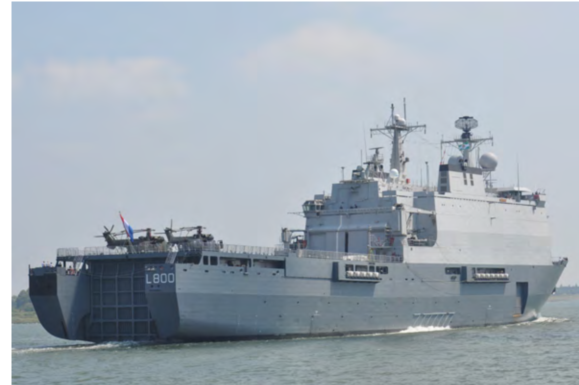
Zr. Ms. Rotterdam (2019)

CUSTOMER: R+S TYPE: Hydrographic Research Vessel (80 m) TYPE OF WORK: Refit SCOPE OF SUPPLY: Modifications PABX.