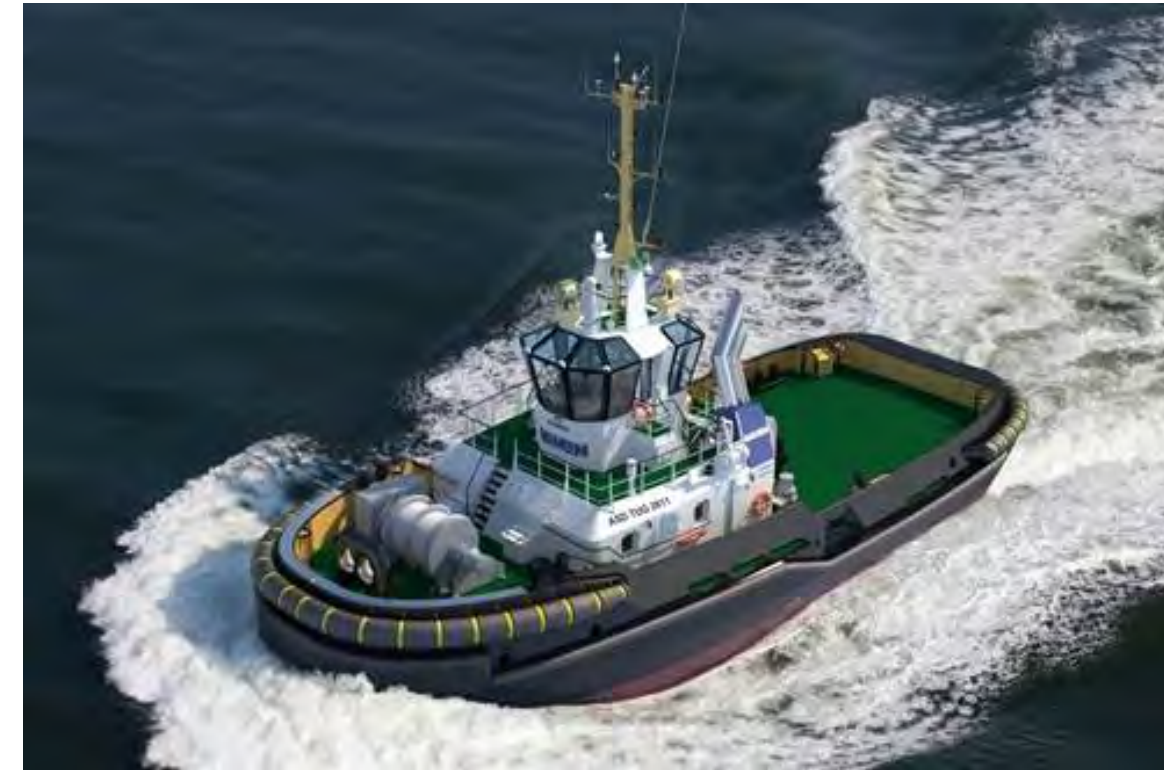
ASD2811 YN513213-14 (2020)

CUSTOMER: Damen Shipyards Gorinchem TYPE: Ice Tug(34 m) TYPE OF WORK: Newbuild SCOPE OF SUPPLY: Switchboards