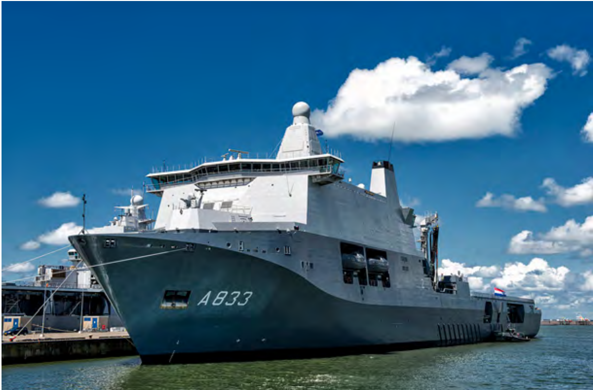
Zr. Ms. Karel Doorman (2015)

CUSTOMER: Damen Shipyards Gorinchem TYPE: Offshore Patrol Vessel (55 m) TYPE OF WORK: Newbuild SCOPE OF SUPPLY: Electrical package delivery. Engineering, installing and commissioning.