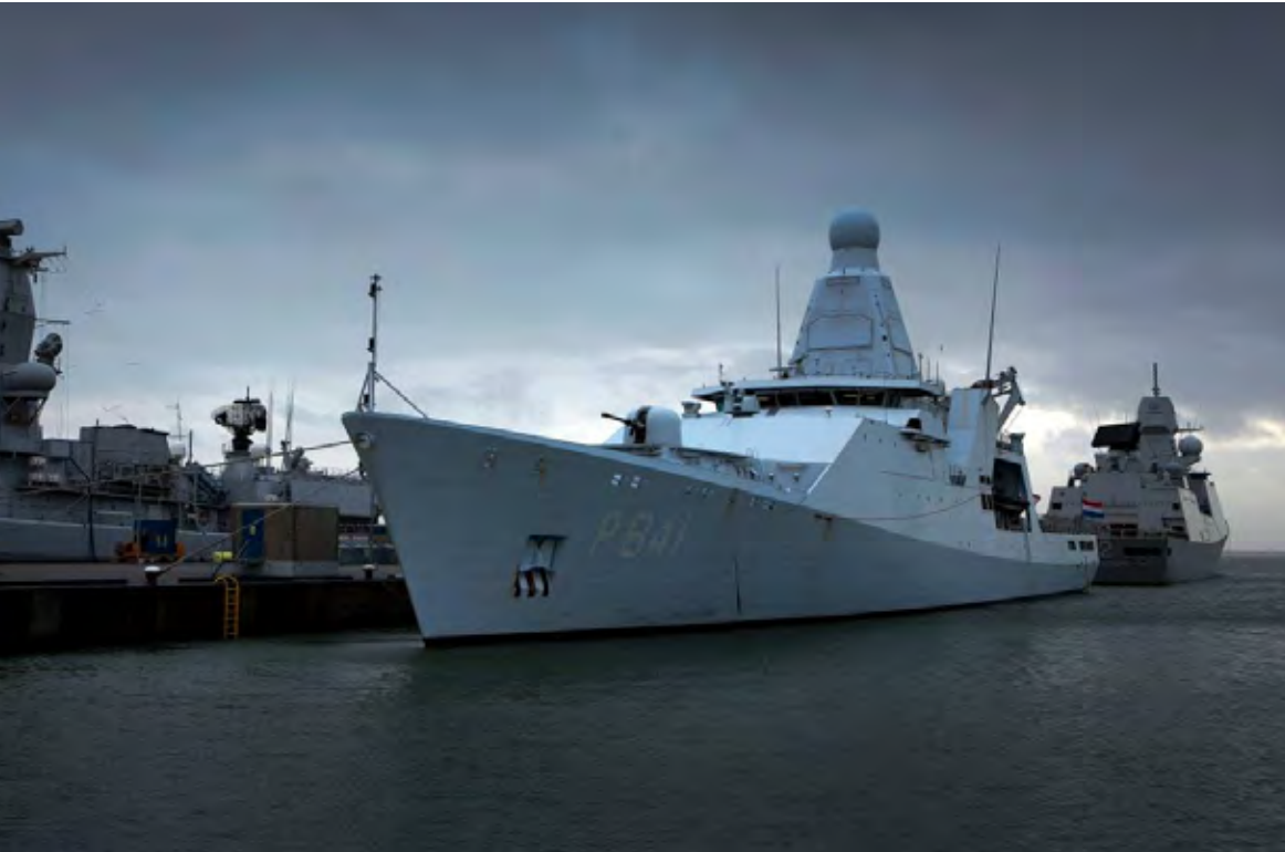
Zr. Ms. Zeeland (2013)

CUSTOMER: Damen Schelde Naval Shipbuilding TYPE: Joint Logistic Support Ship (204.7 m) TYPE OF WORK: Newbuild SCOPE OF SUPPLY: Installation of the electrical systems including command & control, PDU and production of 44 consoles.