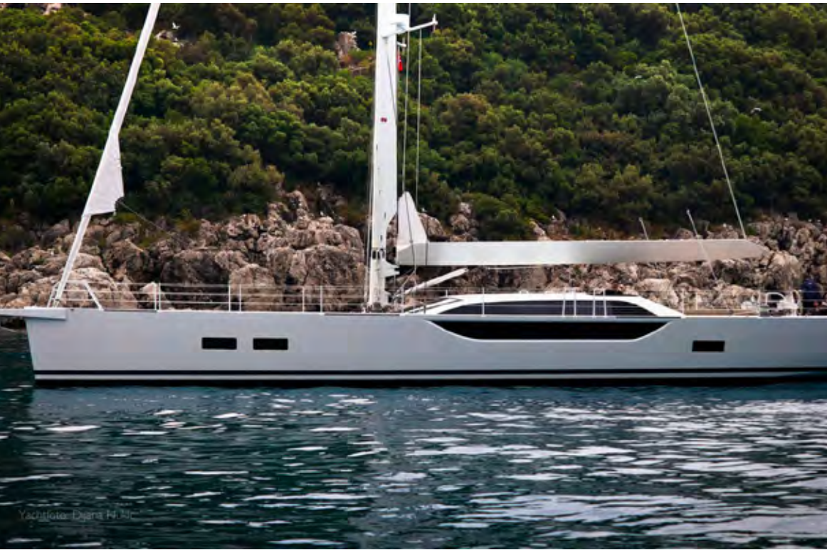
Bliss II (2014)

CUSTOMER: Alia Shipyards Turkey TYPE: Motor Yacht (60.4 m) TYPE OF WORK: Newbuild SCOPE OF SUPPLY: System integration and complete electrical installation.