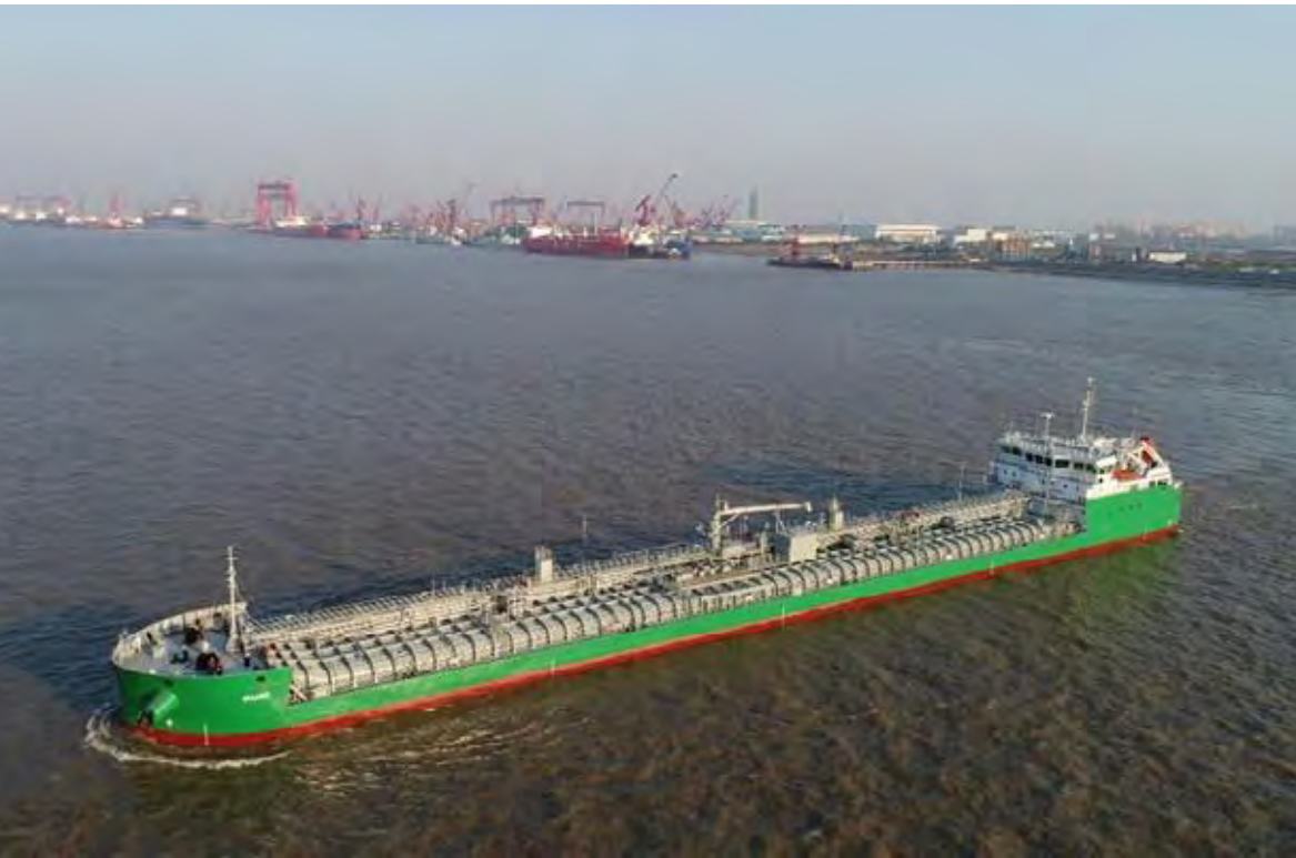
Maaike and Linda (2018)

CUSTOMER: Damen Shipyards Gorinchem TYPE: Combi Freighter (88 m) TYPE OF WORK: Newbuild SCOPE OF SUPPLY: Infrastructure (Cable Routing, Cable Trays), switchboards and consoles.