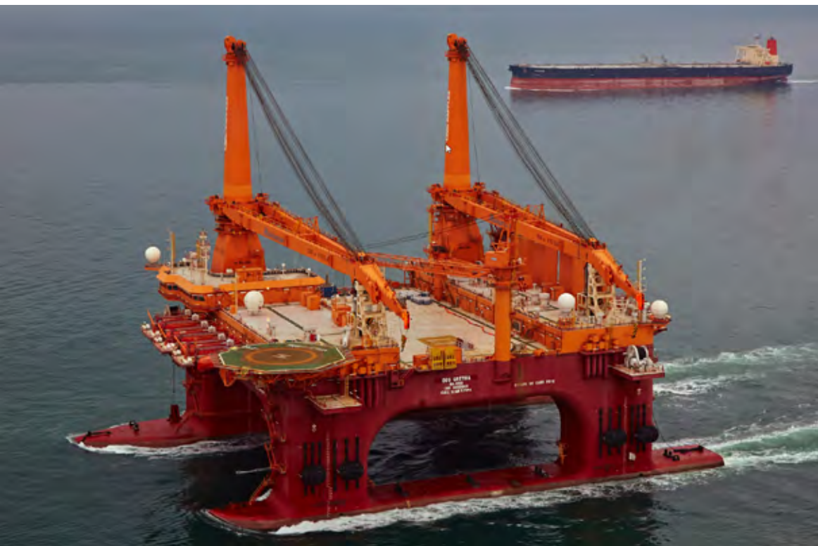
OOS Gretha (2013)

CUSTOMER: AMS TYPE: Accommodation Jack-Up Platform (84 m) TYPE OF WORK: Refit SCOPE OF SUPPLY: Conversion to accommodation platform.