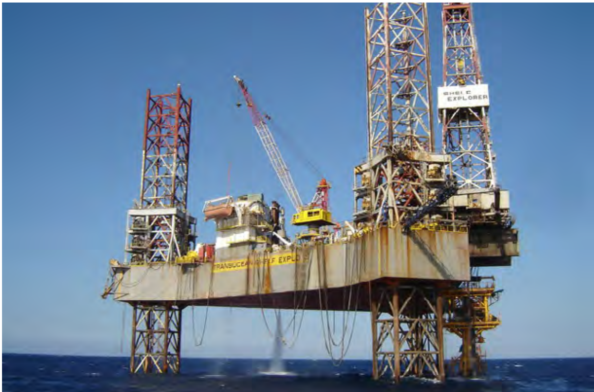
Atlantic Amsterdam (2013)

CUSTOMER: AMS TYPE: Accommodation Jack-Up Platform (94 m) TYPE OF WORK: Refit SCOPE OF SUPPLY: Conversion to accommodation platform.