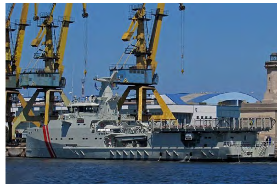
OPV 6711 UAE / Arialah (2016)

CUSTOMER: Damen Schelde Naval Shipbuilding TYPE: Guided-missile Frigate (105.1 m) TYPE OF WORK: Newbuild SCOPE OF SUPPLY: Engineering and integration of platform system, materials and equipment/ system delivery, installing of cable and set to work activities.