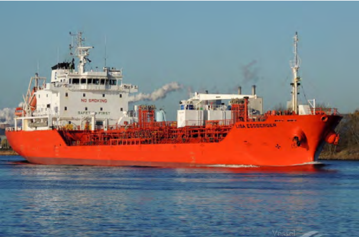
Essberger vessels: Lisa, Lucy, Caroline, Ursula, Anneliese and Wilhelmine (2016)

CUSTOMER: Royal Bodewes TYPE: Cement Carrier (103 m) TYPE OF WORK: Newbuild SCOPE OF SUPPLY: Complete electrical installation, automation systems, switchboards and consoles.